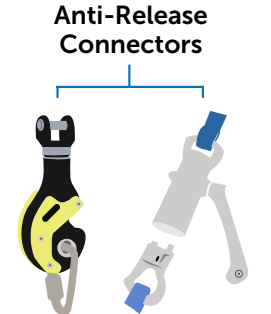
Self Belay Belay Mate