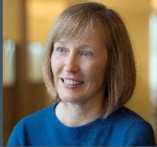
Liz CEO Global HQ