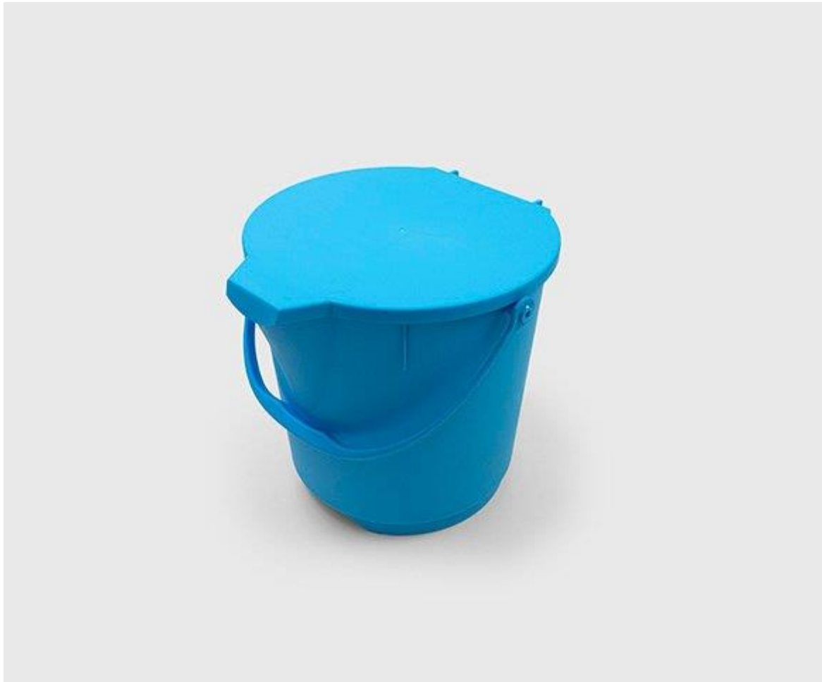
MBK15 bucket and MBK15/LID hinged lid.