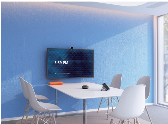
Figure 4-1. The Yealink MVC320

Yealink offers the MVC640 and MVC320 intelligent conference room solutions. Among these, the Yealink MVC640 includes the MCore microcomputer and MSpeech intelligent speaker, and is equipped with a UVC84 4K HD camera, allowing it to easily achieve conference/camera control and content sharing via the MTouch II touch panel. The MVC320 is oriented toward focus and small conference rooms and can provide users with a native Microsoft Teams Rooms experience.