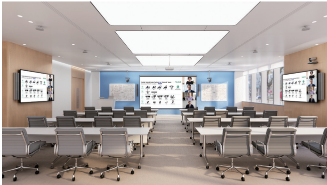
Figure 1. The Yealink MVC940 is suitable for extra-large conference rooms (18 to 31 people)

MVC940/MVC840, Yealink’s solution for large conference rooms, offers a multi-camera solution that supports image stitching and allows users to flexibly switch camera layouts as needed. The UVC84 camera supports 4K ultra-high definition image quality and is equipped with a 12x optical zoom lens to provide clear and lossless images. The solution achieves in-depth network optimization and supports up to 4 wireless presentation dongles for smooth switching from wired to wireless presentation. This not only helps to improve network fluency and reduce the effects of network failures, but it is also makes it easier for users to share content anytime and anywhere, making it particularly suitable for large meeting/conference spaces, large training rooms, etc.