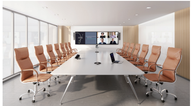
Figure 2. The Yealink MVC840 is suitable for large conference rooms (12 to 18 people)