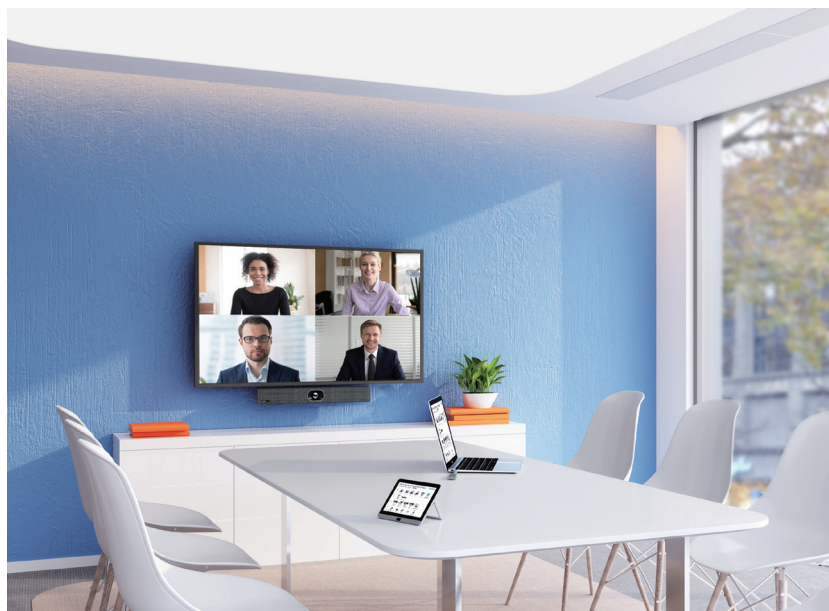
Figure 3. The Yealink MVC400 is suitable for small conference rooms (2 to 7 people)

As for the video conferencing needs of small conference rooms, Yealink’s MVC400 video conferencing solution offers more convenient deployment capabilities, with fewer components and an integrated audio and video design that simplifies deployment and effectively reduces deployment costs. In addition, the solution also supports multiple AI technologies such as Auto Framing with face detection, and Speaker Tracking with sound source localization. Its super-large 133° viewing angle can easily cover every corner of the conference room, while its built-in 8 MEMS microphone array provides a high-quality full-duplex calling experience.