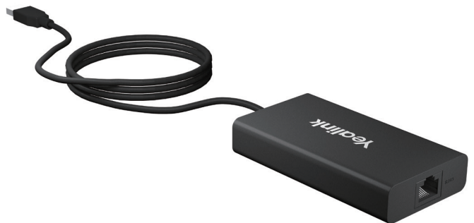
Figure 6. The Yealink MVC-BYOD-Extender

Yealink also offers the MVC-BYOD-Extender solution, which supports switching between Microsoft Teams Rooms (MTR) and different types of UC platforms. Users need only bring their own devices, plug the USB extension cable into their laptops, and then start the meeting according to the specific video conferencing requirements to enjoy the immersive video and audio experience.