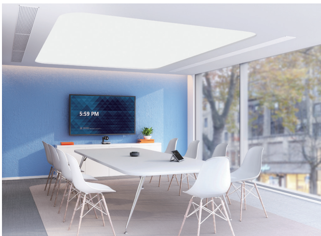
Figure 4-2. The Yealink MVC640

Yealink created the intelligent voice component MSpeech for Microsoft Teams Rooms system, which it integrated into the MVC640/MVC320. This component allows businesses to transcribe the words spoken by attendees into text with high quality, and efficiently respond to complex scenarios such as those in which multiple people are speaking. Moreover, the Cortana voice assistant offers a fully contactless way of operating Microsoft Teams Room and conferences by providing voice commands and controls during conferences, including intelligent voice control tasks such as starting the next meeting, adding people to a meeting or ending a meeting.