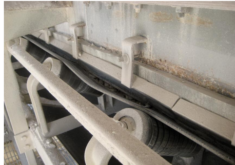
To reduce belt sag, improve the conveyor's belt support system.

It is essential that the stringers – the conveyor's support structure upon which all other components are installed – are straight and parallel for proper belt support. If not, they should be straightened or replaced. Laser surveying is the preferred method for checking stringer alignment.