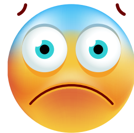
"Cold feet" (pre-trip anxiety)

Our Refund Guarantee Protection plan (RGP) offers a full refund for any cancellation reason 48 hours before trip departure. Plus, the trip price won't go up for everyone else. That's peace of mind for you and your community.