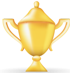
Can't-miss sports tournament