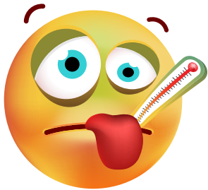
Gastro / stomach bug