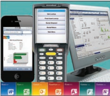
RMI Corp offers its Advantage rental management system as a Cloud product.