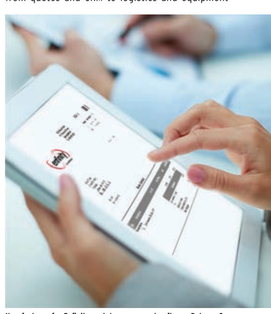
New features for Enfinity rental management software Release 3 have been introduced by Solutions by Computer (SBC), including e-Sign electronic signature capture, StreetEagle GPS mobile workforce management, and consolidated invoicing capabilities

The company's Rental Result software covers the purchase of assets and the asset lifecycle as well as the rental process. This means everything from quotes and CRM to logistics and equipment