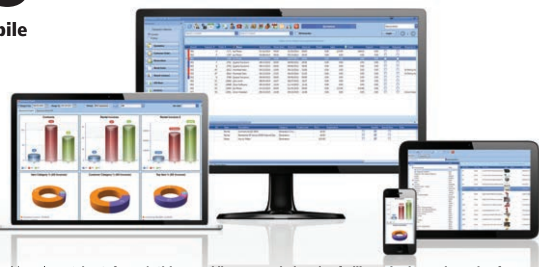
Orion Software's Sirius-e mobile app was designed to facilitate the day-to-day tasks of users in the field, and is compatible with iOS, Android or Windows

Annata said it had several other apps in the pipeline, including one dubbed Rental Inspections,