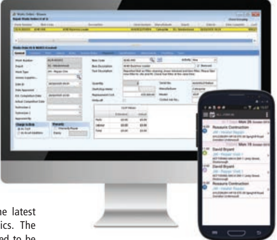
New from MCS is a mobile app for Android designed to simplify and automate a rental company's workshop and maintenance functions

In addition, Orion's app offers e-signatures for documents such as quotations, rental contracts or technical agreements. As well as reducing costs and supporting a paperless environment, the company pointed out that this technology can speed up approval processes for order and delivery confirmation as well.