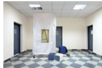
PART NO: ICMOBKC

*Note ladder not included in either package