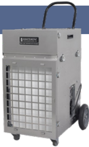
PART NO: PAS2400