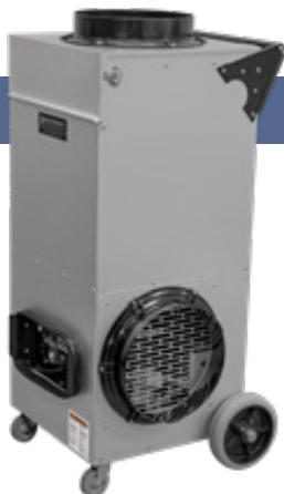
PART NO: PAS1700