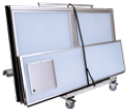
TRANSPORTATION CART PART NUMBER: AGSHIELD-CART2