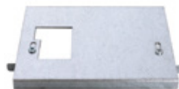
ROOM PRESSURE MONITOR HANGER BRACKET PART NUMBER: AGSHIELD-HWPM2