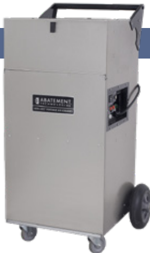
PART NO: PAS1200 / PAS1200UV