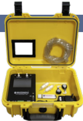
PART NO: PPM3-S

RPM-RT2 Kit includes: 1 ea pressure monitor, 2 ea 25ft of clear tubing, 2 ea temperature/rh sensors and 2 ea 25ft Ethernet cables