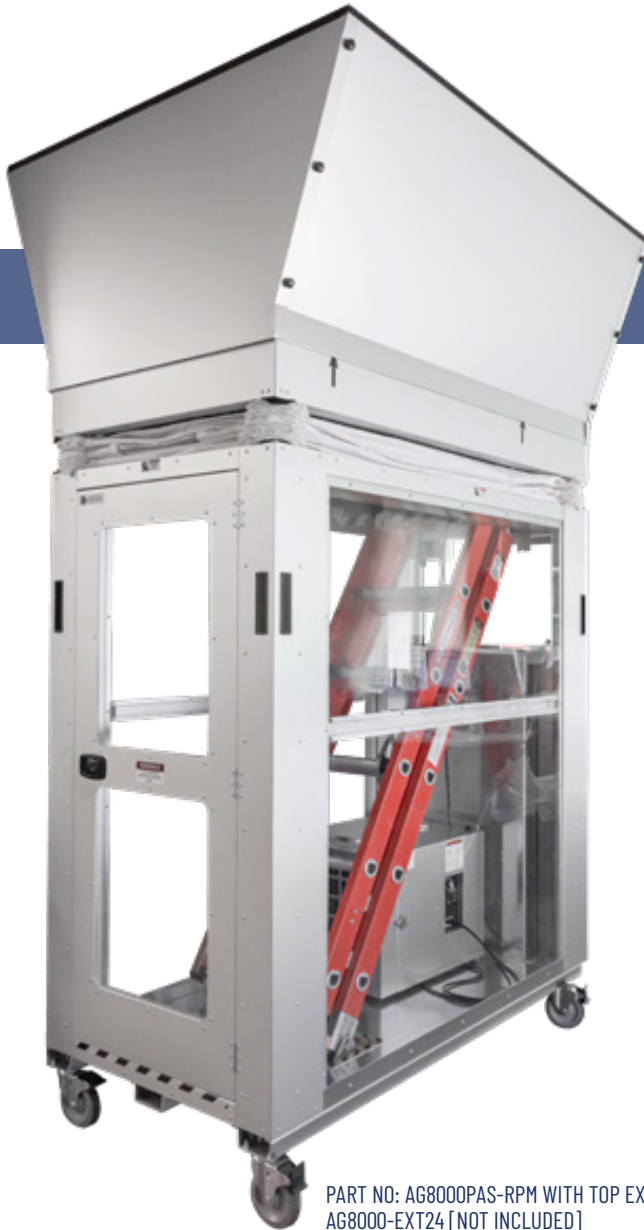
PART NO: AG8000PAS-RPM WITH TOP EXTENSION AG8000-EXT24 [NOT INCLUDED]