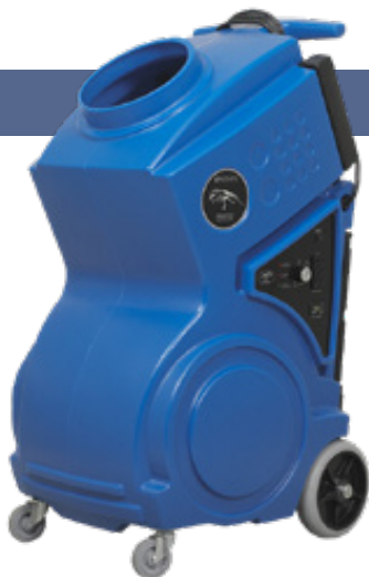
PART NO: PRED1200 / PRED1200UV