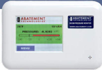
PART NO: RPM-RT1W OR RPM-RT2