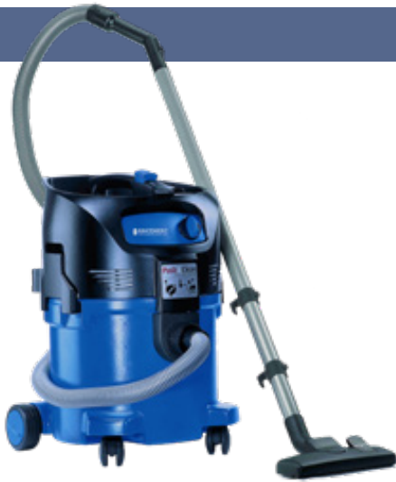
PART NO: V8000WD