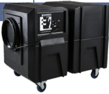
PART NO: BD2KM & BD2KMA