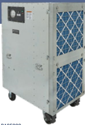
PART NO: PAS5000