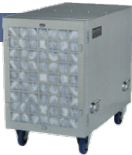
PART NO: H1990M