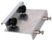
PORTABLE PRESSURE MONITOR HANGER BRACKET PART NUMBER: AGSHIELD-HWPM1