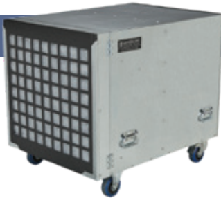
PART NO: H2KM & H2KMA