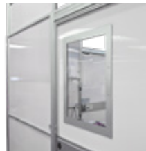
WINDOW KIT PART NUMBER: AGSHIELD-WK