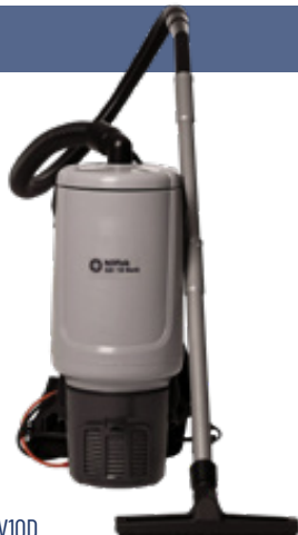
PART NO: V10D