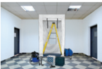
PART NO: ICMOBVC