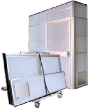
PART NO: AGSHIELD-ART

The Anteroom Kit includes a 4ft universal swing door or optional 42" sliding door, a 4ft panel, a 2ft panel, a 2ft panel with an exhaust port, 2 90° Fixed Corners, 2 Wall Seal Drywall adapter kits, closed cell foam gasket, all necessary hardware and a transportation Panel Cart.