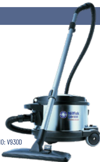
PART NO: V930D