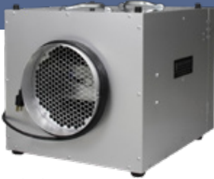
PART NO: PAS750

HEPA-AIRE® models feature tough, corrosion resistant metal cabinets fabricated using airtight “zero bypass” rivet construction.