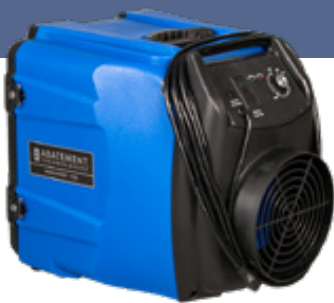
PART NO: PRED750

PREDATOR® models feature ultra-tough and easy to clean rotational-molded polymer housings made from a flame-retardant resin with EPA-registered microbial growth and UV inhibitors.