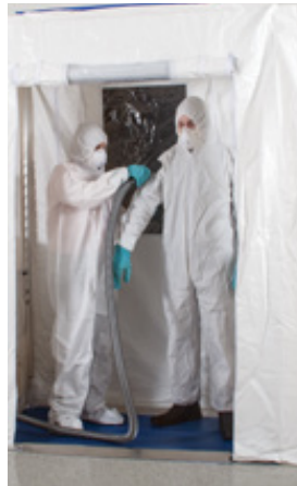
PART NO: AG3100TMK