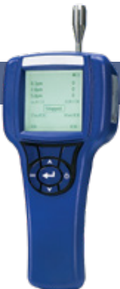
PART NO: PC501