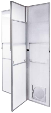
PART NUMBER: AGSHIELD-TO