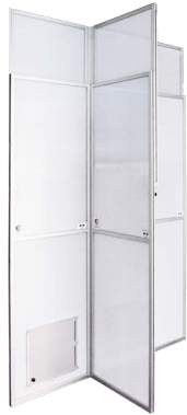
PART NUMBER: AGSHIELD-TI