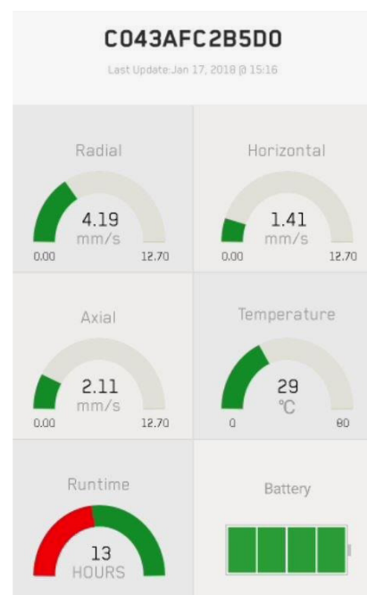
Sample of I-Alert Temp & Vibration Dashboard

Keep track and manage your warranty claims on assets.