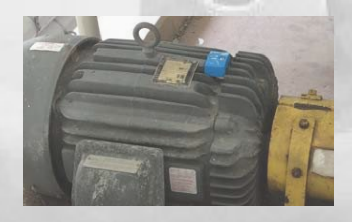
Data syncs wirelessy to Maptsoft handheld via Bluetooth