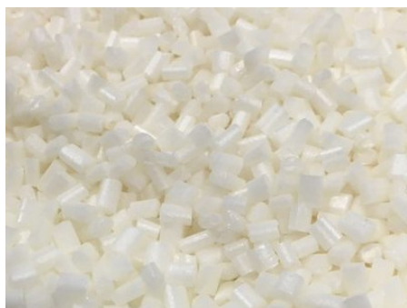
PICTURED: Close-up of E Grade