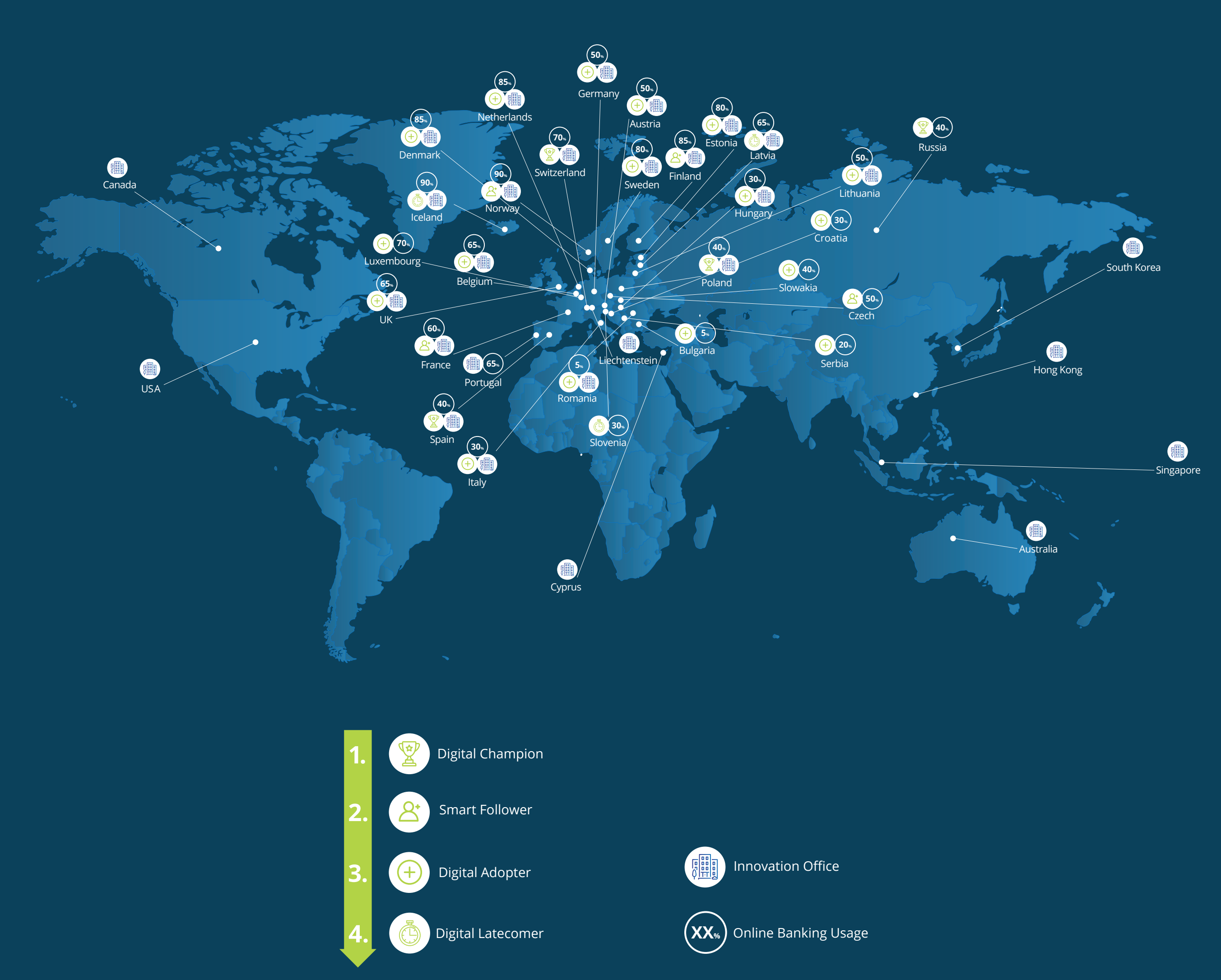
Quelle: Deloitte Development LLC, Whitepaper: EMEA Digital Banking Maturity 2018 Innopay, Whitepaper: Mastering Open Banking: How the 'Masters in openness' create value, 2018

OPEN BANKING / PSD2 STATUS MARKET STATUS JAN 2019