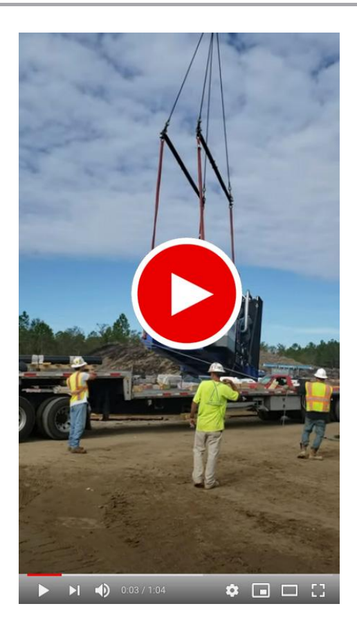
mtu 1750 kW generator provided by Curtis Power Solutions for NE Brunswick (NC) Regional Water Reclamation Facility.