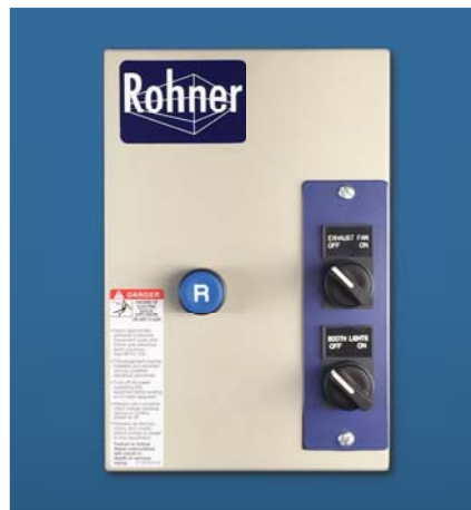
Standard IOF Control Panel

Booths are designed to meet or exceed NFPA33 and IFC Chapter 24 requirements. Consult your local authority having jurisdiction for additional requirements before purchasing.