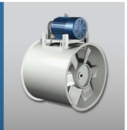
Cast Aluminum Fan with TEFC Motor