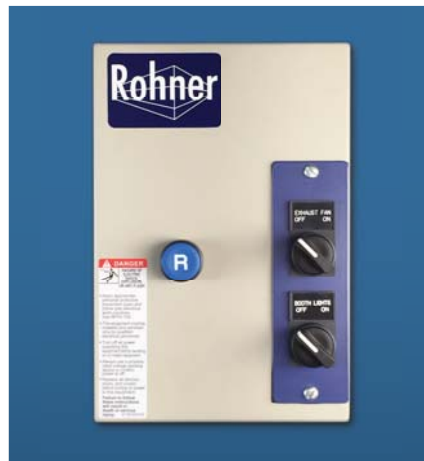
Standard IOF Control Panel

Booths are designed to meet or exceed NFPA33 and IFC Chapter 24 requirements. Consult your local authority having jurisdiction for additional requirements before purchasing.