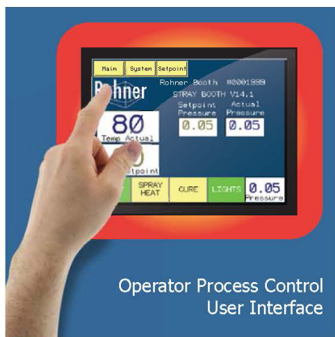
Operator Process Control User Interface

Perfect for managers and service technicians - use the optional wireless feature to remotely monitor and control your process. Application runs on all Android & IOS devices.