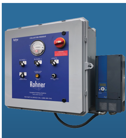
NEMA 12 Dust Tight Industrial Control Panel

Booths are designed to meet or exceed NFPA33 and IFC Chapter 24 requirements. Consult your local authority having jurisdiction for additional requirements before purchasing.