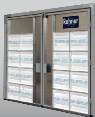
Optional Filtered Product Doors