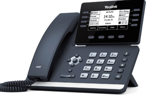
Adjustable Corded-Cordless Content