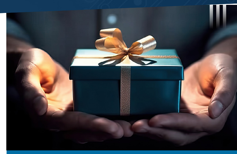
Social engineers use reciprocation not as a kind gesture, but as a compliance tactic for getting private data.

Understanding these principles can help you better educate your employees on some common social engineering tactics hackers use.