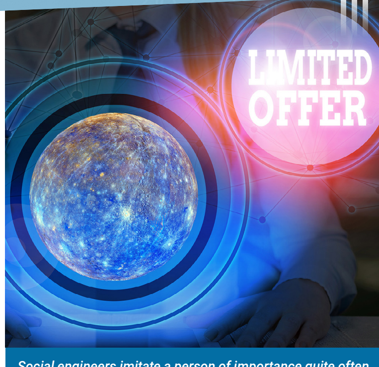
Social engineers imitate a person of importance quite often, using a false sense of authority and urgency to get their way.

A social engineer may know a manager is out of the office and create a spoofed email address to ask a staff member to route money from one location to another since the boss is busy or on vacation. Because an authority figure demanded the action, some employees may do it without thinking, fearing reprimand from management for hesitating.