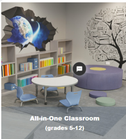
All-in-One Classroom (grades 5-12)