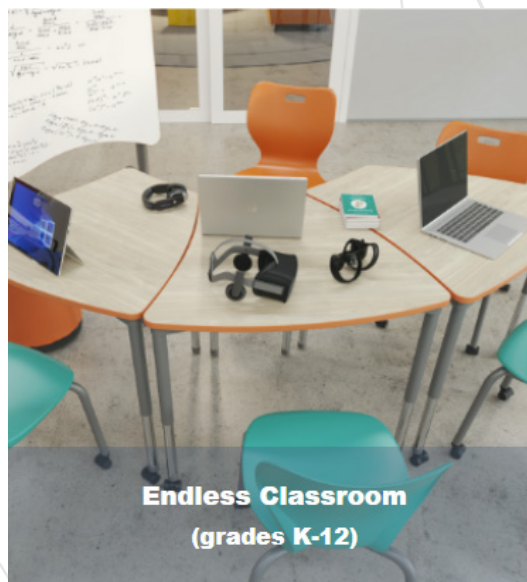
Endless Classroom (grades K-12)