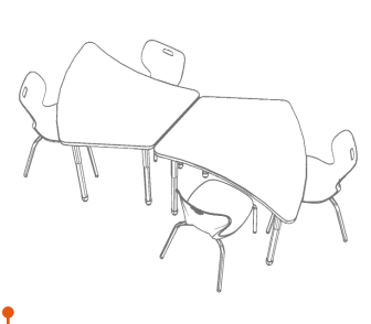
Cooperative Learning Brings together small teams of students with different levels of ability