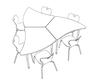
Active Learning Engages students in the learning process

Project Based Learning Team up for long-term projects that investigate real-life problems or challenging questions