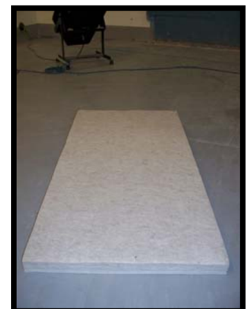
Ear Controlled Data

The sample was identified as Polyester Acoustic Panel. The sample was received in 24" x 48" x 2" nominal sections (9 sections received). The exposed area was a total of 72 ft 2 and weighed 57.6 lbs.