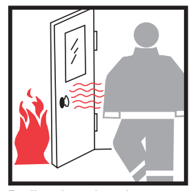
Radiant heat from hot surfaces and flames can cause burns

Convected heat travels through the air, even if there is no immediate appearance of fire. However, convected heat can elevate the temperature of your Pants enough to cause a conductive heat burn when the fabric comes into contact with your skin. Your Pants does not have a thermal liner. Therefore, NFPA 1951/NFPA1977/ NFPA 1975 Tri-Certified Pants should not be used in situations of high temperature.