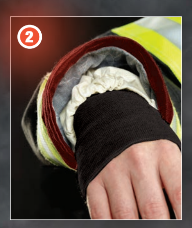
ARM GUARD Elasticized wrist shields and enhanced IsoDri® knit wristlets with Nomex<sup>®</sup> Nano Flex help block particulates at the coat-to-glove interface.

PARTICULATE-BLOCKING HOOD A breathable, ultra-soft hood with StedAir<sup>®</sup> PREVENT protects the head and neck from particulates, while also providing excellent mobility and unrestricted hearing during firefighting activities.