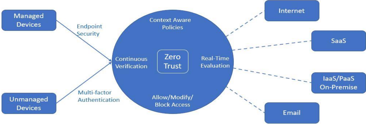
Figure 1: Zero-Trust Architecture

everyone and trust no one. A zero-trust model supports micro-segmentation, which is a fundamental principle of cybersecurity. It enables us to contain potential threats and not let them spread throughout the enterprise. Zero-trust network access (ZTNA), which is part of the zero-trust model, uses identity-based authentication to provide access while keeping the network location, i.e. the IP address, hidden. When adopting a zero-trust security model – whether in the cloud or on-premises, it is required to enforce user access policies and have robust authentication mechanisms and tools for creating software-defined security perimeters.