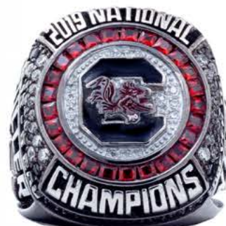
F46 South Carolina Lacrosse