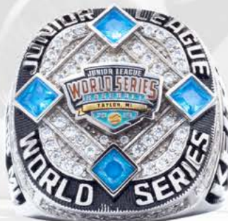
F40.3 Junior League World Series