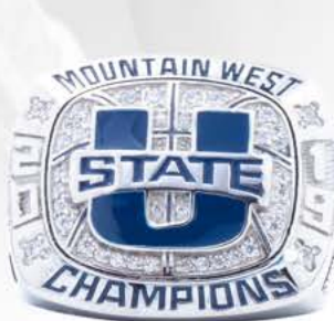
H17 Utah State