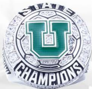
F08 Upland High School