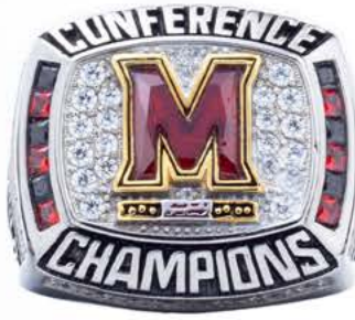
H02 University of Maryland