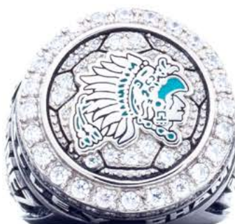
F04 Mendota High School