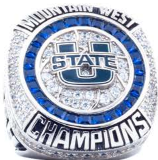
F03 Utah State