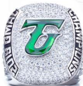
V33 Tiffin University