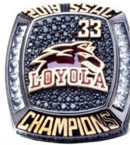
V01 Loyola University