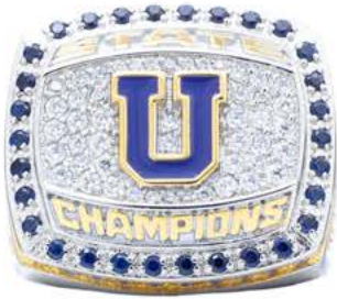
H25 University HS of Indiana