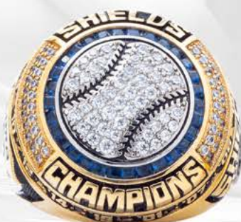
R13 Shields Baseball