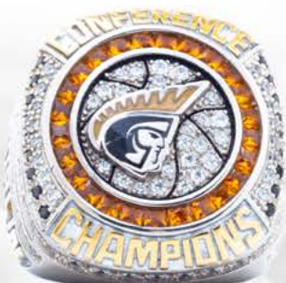
F09 Anderson University