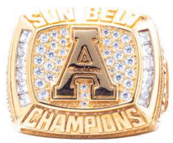
H03 Appalachian State University