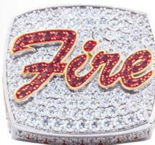
H20 Columbus Fire Football