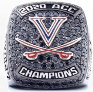
V15 University of Virginia