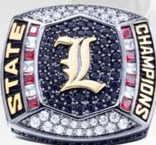
H15 Lisbon Public Schools