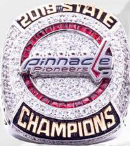
R46 Pinnacle Pioneers