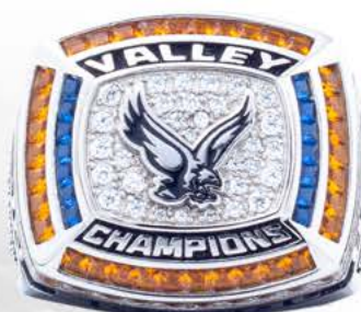
F11 Community Christian HS