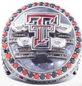
R18 Texas Tech University