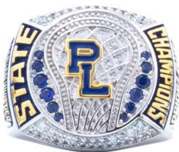
F01 Prior Lake Lacrosse

Find inspiration in some of our past designs