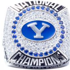
R26 Brigham Young University