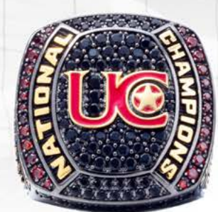
V55 University of Charleston