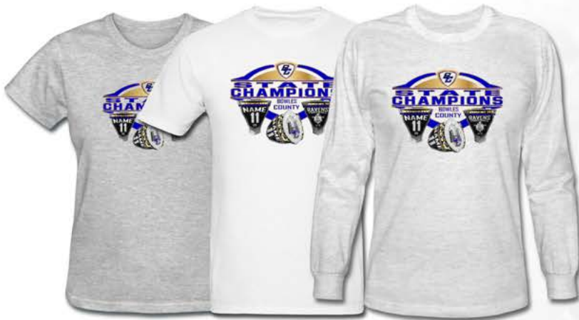
Short Sleeve & Long Sleeve T-shirts

Inquire for More Color options & pricing