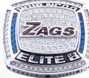
H10 Gonzaga University