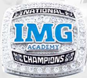
H04 IMG Academy