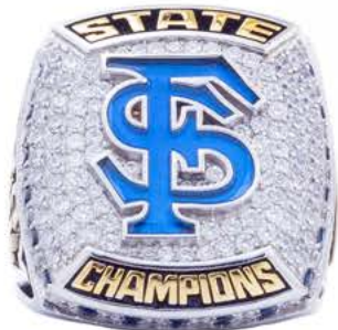
V15 Fairmont High School