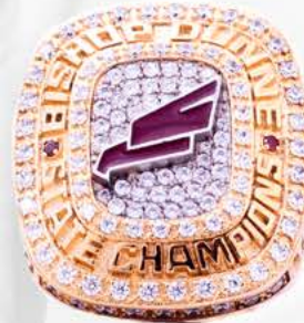
V08 Bishop Dunne Falcons