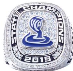
V31 Victoria Cobra Athletics