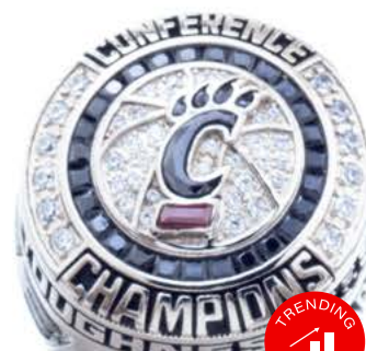
F05 University of Cincinnati