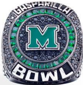
R20 Marshall University