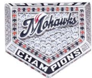
H15 Mohawks Baseball