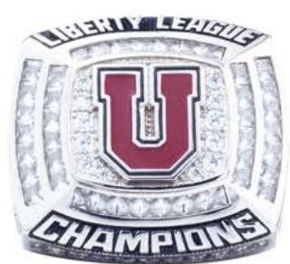
H23 Union College