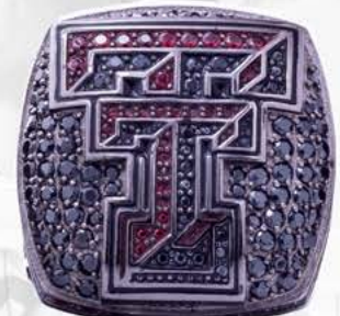
V26 Texas Tech University