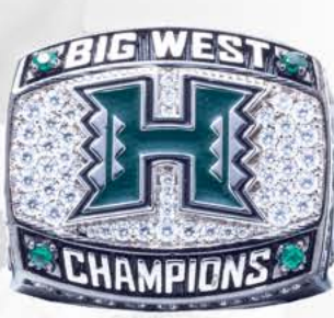
H01 University of Hawaii