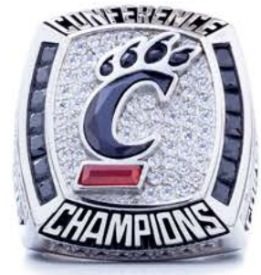
V01 University of Cincinnati