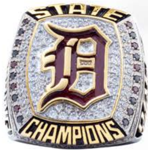
V04 Dale High School