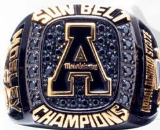
V19 Appalachian State University