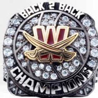
F41 Walsh University