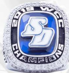
V23 University of San Diego