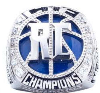
F27 Ripon Christian HS