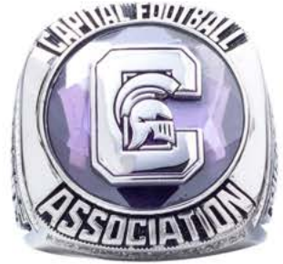
R44 Capital University