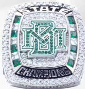
V05 Brushy Public Schools