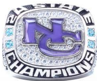
H29 Nemaha Central High School