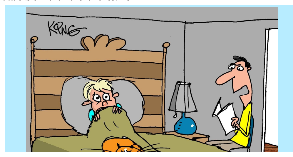
"He opened his email and saw the attachment from an unkown source. His hand slowly reached to click on the paper clip. He had no idea what horror awaited him...'

The bottom line is that digital security is top priority for cloud platforms. Not only do these providers need to meet the requirements of their clients, but they must also follow international rules and regulations. If you want to keep your data backed up and secure, the cloud is your answer. Forbes, April 1, 2021