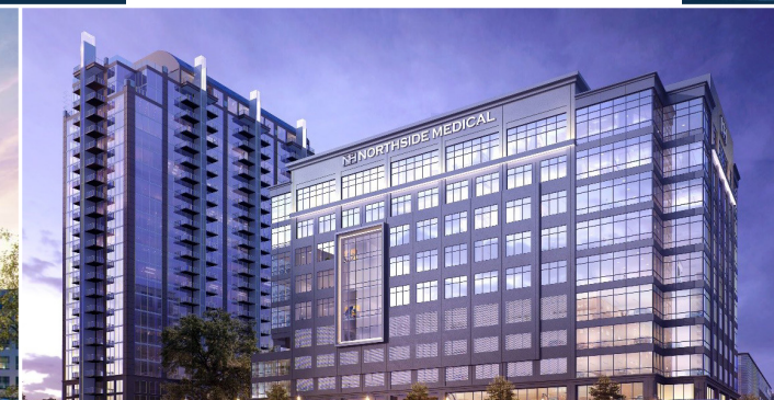
Northside Hospital Midtown Medical Office Building