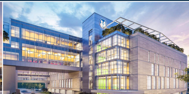
East Tennessee Children's Hospital Scripps Networks Tower Expansion