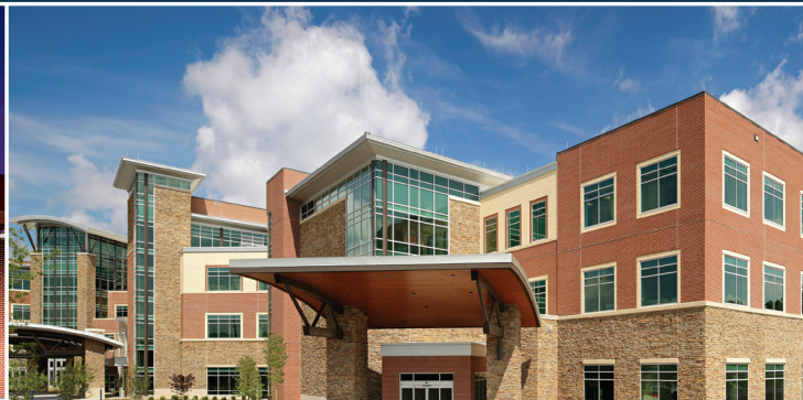
Ballad Health Regional Hospital System NE Tennessee and SW Virginia