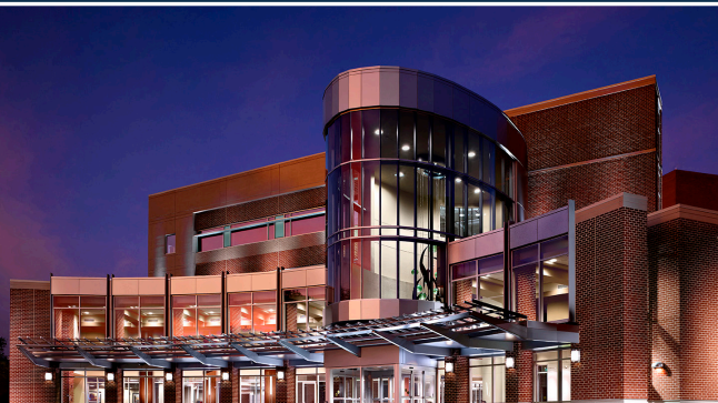
University of Tennessee Academic Medical Center Knoxville, TN

We know that in this competitive era of healthcare reform, hospitals, medical office buildings, and other ancillary facilities must be positioned as strategic assets and managed for optimal operational advantage. RTG's approach to operations involves a broader view of the strategic plan for one or more assets, market position, capital and financing strategies, and partnership management.