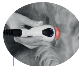
DERMATOLOGY Stimulation of tissue repair processes.

The handpiece connection system ensures automatic adaptation of parameters.