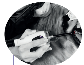
ORAL PATHOLOGIES Analgesic, anti-inflammatory action and stimulation of tissue repair.