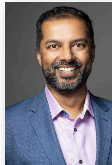
Cijoy Olickal Fogo de Chão