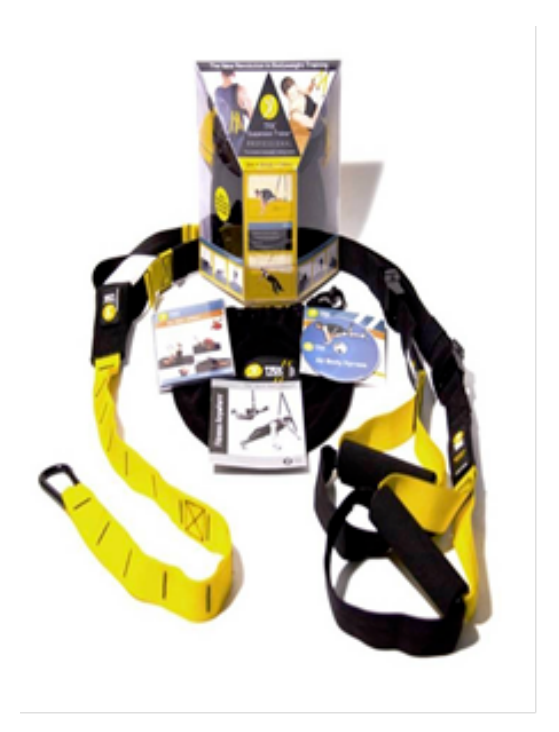
The U.S. Consumer Product Safety Commission (CPSC) is still interested in receiving incident or injury reports that are either directly related to this product recall or involve a different hazard with the same product. Please tell us about your experience with the product on <a href="SaferProducts.gov">SaferProducts.gov</a>.

CPSC is charged with protecting the public from unreasonable risks of injury or death associated with the use of the thousands of consumer products under the agency's jurisdiction. Deaths, injuries, and property damage from consumer product incidents cost the nation more than $900 billion annually. CPSC is committed to protecting consumers and families from products that pose a fire, electrical, chemical, or mechanical hazard. CPSC's work to ensure the safety of consumer products—such as toys, cribs, power tools, cigarette lighters, and household chemicals—contributed to a decline in the rate of deaths and injuries associated with consumer products over the past 30 years.