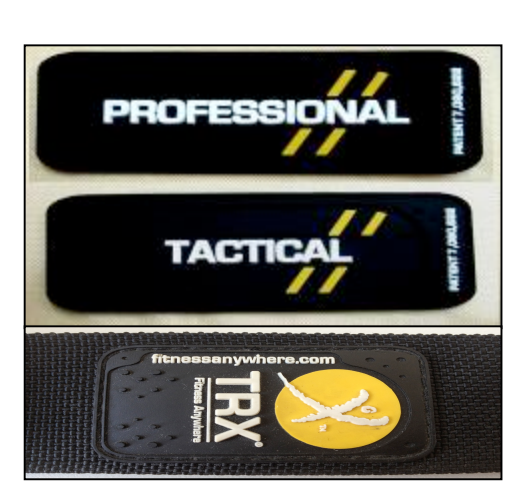
Recalled P1 and T1 TRX Suspension Trainer devices have badges with raised dots or double lines