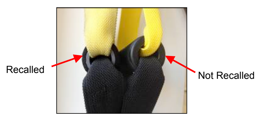
Recalled P1 and T1 TRX Suspension Trainer devices do not have end bumpers on the hand grips.