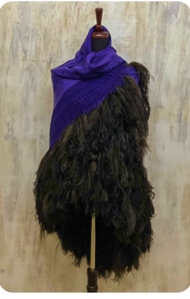
A65 Spanish Shawl Triangular wrap with hand embroidery, hand knotted border and ostrich feather trim • $3,375

Top across – 74".Sides – 62", Knotted border – 6"Ostrich feather trim – 13"