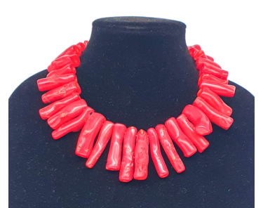
A15 Finger Coral Necklace. • $938 Ships December. 17".