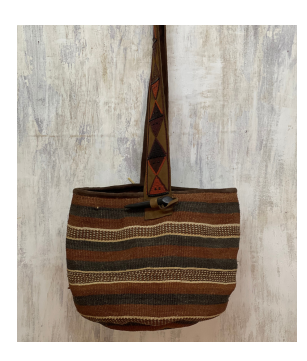
A102 Baobab fiber Basket with beaded handle and cow horn detail 2 • $638 Hand woven, natural root and plant dyes, tone on tone leather handle and beading. Height 14" width 20" circumference 40" Strap 42".