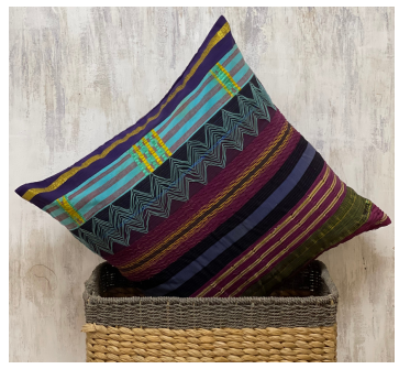
A173 Reconstructed West African Asoke cloth cushion cover 8 • $360 Striped Cushion 30" x 30".