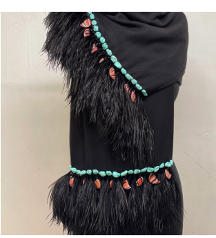
A82 Black Cashmere Luxe • $2,213 Black turquoise beaded trim, ostrich feather. Turquoise bead detailing with black ostrich feather trim interlaced with pink West African trade beads. 26"x80" feathers 6"