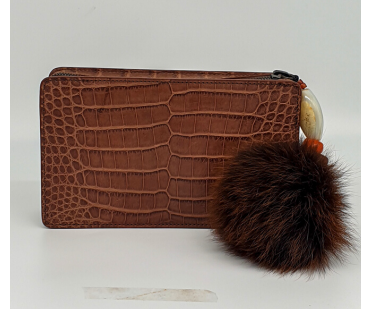
A49 Nile Crocodile Belly Box Clutch • $2,137 Fox Pom Pom and agate trade bead zipper pull. Ships December. Height 5", width 10", Depth 2".

Classic hobo bag design with hand cut fringe. Suede Ostrich shin flap with horn detail. Height 13", width 13", depth 8", handle 24 ", fringe 6".