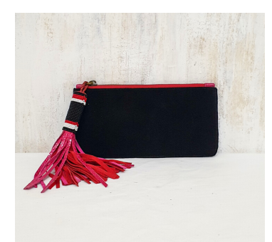
A41 Maa pouch (flat) S • $142 Black with toggle zipper pull. Height 5", Width 9".

Traditional design. Fits from 28" to 33".