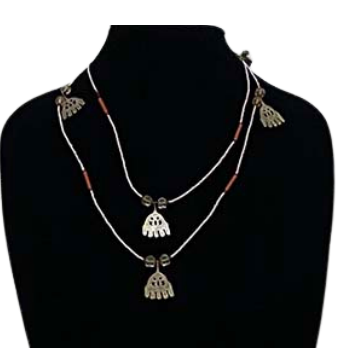
A9 Leila Pink $450 Glass beads with silver pendants. 44".