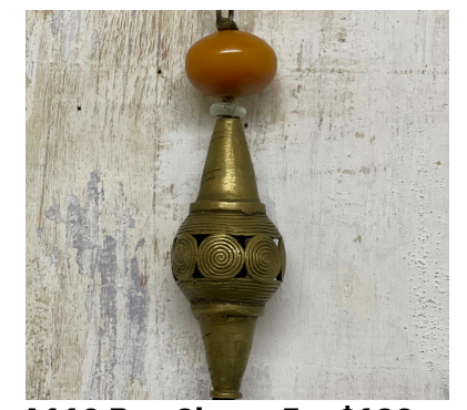
A110 Bag Charm 5 • $132 Antique brass emblem and trade beads leather 10".