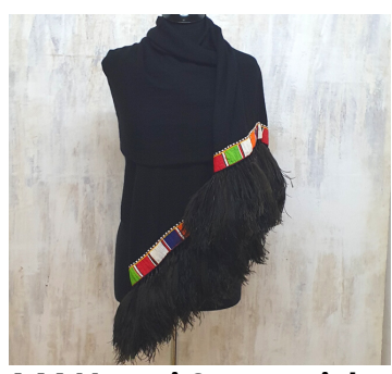
A44 Maasai Ceremonial Shawl • $2,077 Black Cashmere, Maasai beaded band, black ostrich feathers. Winter weight. 36" x 84", Beading 2" feathers 6".