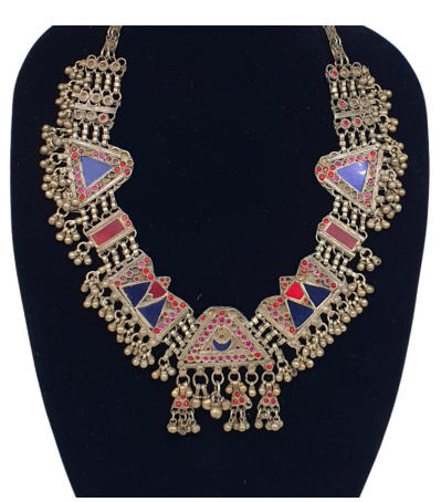
A6 Afghan Tribal Necklace (original piece) $728 • 27".