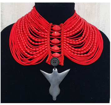
A27 Maa Choker with cow Horn Emblem L • $338 Red. 16".