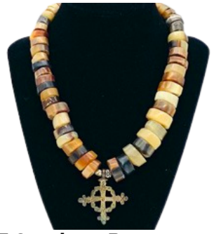
A7 Cow horn Rosary Beads with Coptic Cross • $675 18" (1.5" pendant).