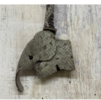
A127 Elephant Keyring 3 • $15 Grey faux Python and black. Elephant (2x2") ring strap (3").