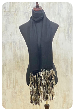
A86 Black Necktie with Rooster Feather Trim • $713 12"x64" feathers 12".