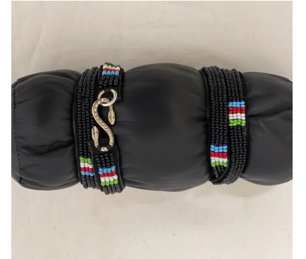
A24 Maasai wrap bracelets with silver clasp Medium • $112 each Leather with traditional beading . 15"

Stone with traditional beading. Handle drop 11", height 13", width 16", tassels 7".