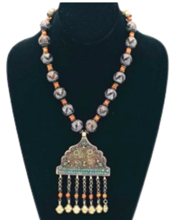
A1 Black coral beads with silver inlay, antique Persian pendant • $2,925 Ships early December . 22" (4"pendant).