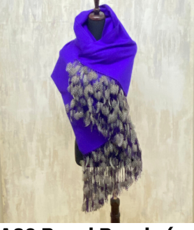
A80 Royal Purple (papal) Cashmere Wrap with Guinea Fowl feather trim • $1,493 Winter Weight. 28"x80" feathers 12"