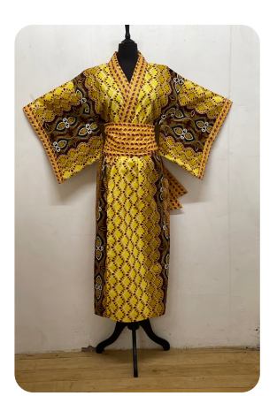
A153 West African Waxed Cotton Kimono 6 • $188 100% Cotton, one size.