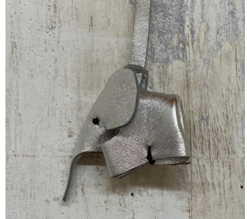
A131 Elephant Keyring 7 • $15 Silver and black. Elephant (2x2") ring strap (3").