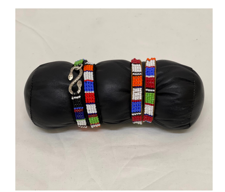
A25 Maasai wrap bracelets with silver clasp XXS • $112 each Leather with traditional beading . 12"

Red with traditional beading. Handle drop 11", height 13", length 16", tassels 7".