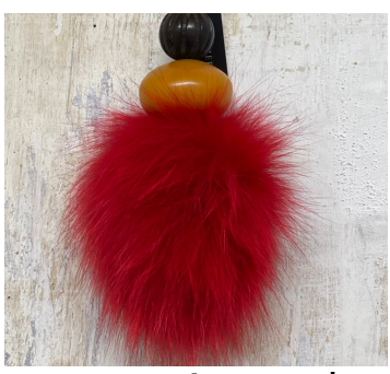
A108 Bag Charm 3- $169 Fox fur pom pom and trade beads, leather, 12".