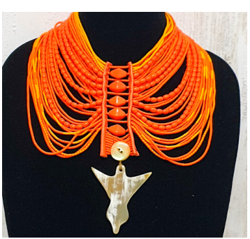
A28 Maa Choker with cow Horn Emblem S • $338 Orange. 14".