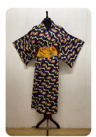
A154 West African Waxed Cotton Kimono 7 • $188 100% Cotton, one size.