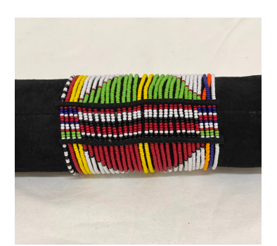
A32 Maasai gladiator bracelet with snap button closure M • $109