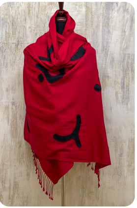
A66 Kuba Design Cashmere Wrap • $1,485

Top across – 74".Sides – 62", Knotted border – 6"Ostrich feather trim – 13"