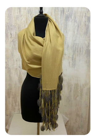
A71 Ivory Cashmere Wrap with Guinea Fowl feather trim • $1,493 28"x80" feathers 13"