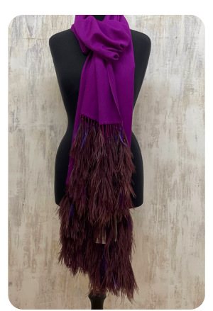
A75 Fuchsia Cashmere Wrap with grape Ostrich and rooster feather trim • $1,493 28"x80" feathers 12".