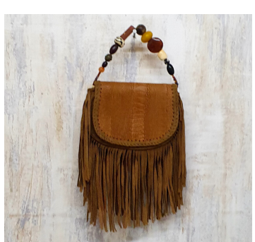
A59 Navajo style clutch bag (cognac) • $1,013 Ostrich shin with hand cut fringe and Trade bead handle. Height 5", width 7", handle drop 4 ", fringe 6".

broach, trade bead handle. Height 5", width 7", handle drop 4 ", fringe 6".