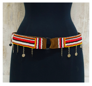
A36 Beaded belt 2 multi size Velcro closure • $150

Traditional design. Fits from 23" to 42".