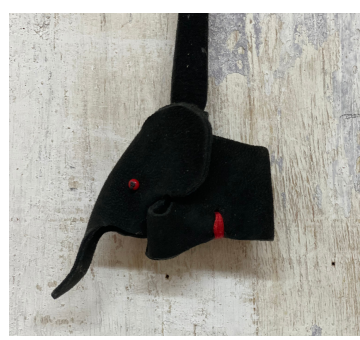
A130 Elephant Keyring 6 • $15 Black and red. Elephant (2x2") ring strap (3").