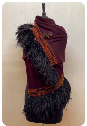
A61 Ceremonial Shawl • $2,077

Brown Cashmere wrap with tone on tone beaded band and black ostrich feather trim. 36"x80" beading 2.5" and feathers 6".