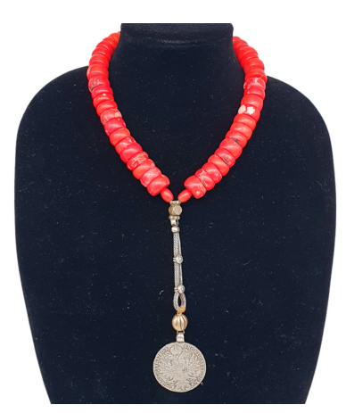
A3 Coral necklace with Autrian 1780s Coin Drop Pendant • $1,275 Ships early December. 17" (6" pendant).