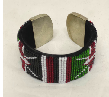
A39 Maasai Beaded Cuff with silver tips 1 • $345 Adjustable (crimp on) suede with beading . 8" long, 1.5" wide.

Traditional design. Fits from 23" to 42".