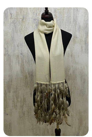
A88 Ivory Necktie with Rooster Feather Trim • $713 12"x64" feathers 12".