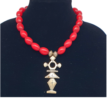
A8 'Amber" trade beds with Tuareg emblem. • $338 17" (3" pendant).