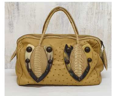
A51 Ostrich Skin Mini Bowling Bag • $2,738 Ostrich shin handles, cow horn and antic brass studs. Height 9", width 12", handle drop 4", depth 7".