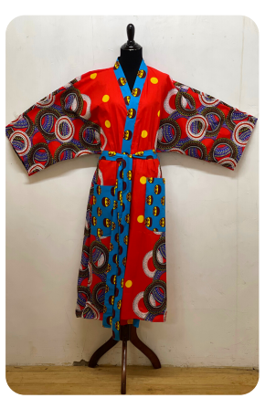
A159 West African Waxed Cotton Robe 5 • $188 100% Cotton, one size.