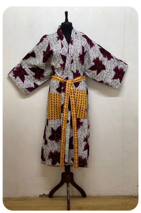
A156 West African Waxed Cotton Robe 2 • $188 100% Cotton, one size.