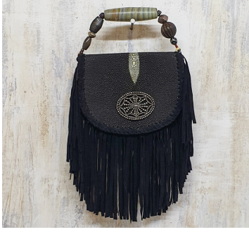
A58 Navajo style clutch bag (black) • $1,387 Sting ray with 1920s

A60 Navajo style clutch bag (chestnut) • $1,012 Ostrich shin with hand cut fringe and Trade bead handle Height 5", width 7", handle drop 4", fringe 6".