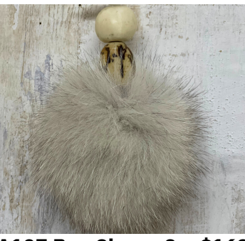
A107 Bag Charm 2 • $169 Fox fur pom pom and trade beads, leather, 12".