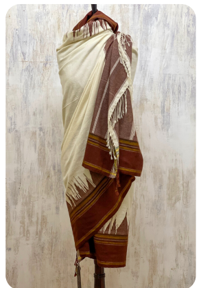
A67 Somali Style Blanket Wrap (men's size) • $2,400 Huge cashmere wrap ivory and red brown. 80" x 52".