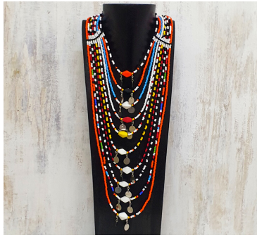
A30 Magadi necklace • $112

Traditional Necklace original. 15" drops down approx.12".