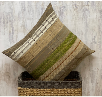
A167 Reconstructed West African Asoke cloth cushion cover 2 • $360 Striped Cushion 30" x 30".