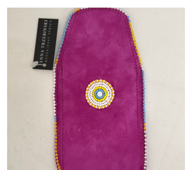
A121 Handmade glasses cases with beading detail 7 • $64 Beaded, suede. 3.5" x 6.5".