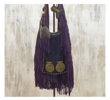
A56 Nicky Fringe Bag Deep Purple Couture • $2,625 Hand cut fringe, trade bead detailing, original west African brass pieces. Height 11", width 15", handle 15 ", fringe 6".