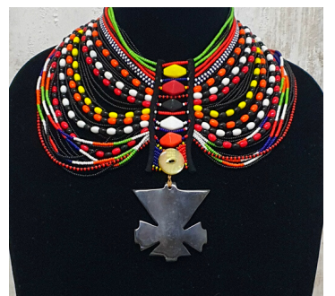
A29 Maa Choker with cow Horn Emblem M • $338 Classic maa colors. 15".