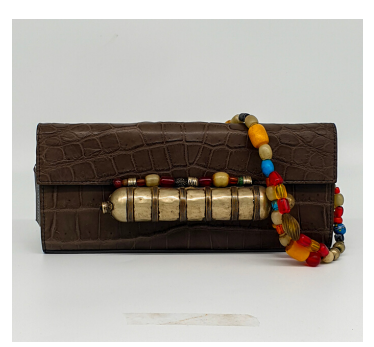
A48 Nile Crocodile Belly Taupe Envelope Clutch • $3,187 Original beaded strap with silver prayer box detail . Ships December . Height 5", width 10", depth 2", handle drop 24".