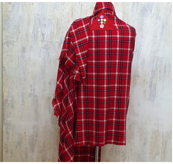
A45 Maasai Shuka • $2,355 Red checked Maasai blanket with beading. 39"x 92" Arm holes 10".