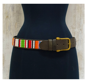
A37 Maasai beaded belt with brass buckle 1 • $102

Traditional design. Fits from 28" to 33".