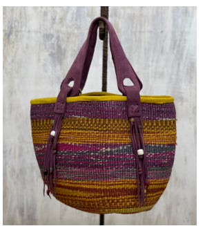
A98 Hand woven, sisal basket 7 • $337

Embellished with trade beads and a leather handle. Yellow and purple and pink hues. Height 11" width 16" circumference 33"handle 17".