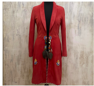
A31 Signature Ntito Coat • $2,243 Requires direct

communication with Anna. Made to measure or existing pieces available.