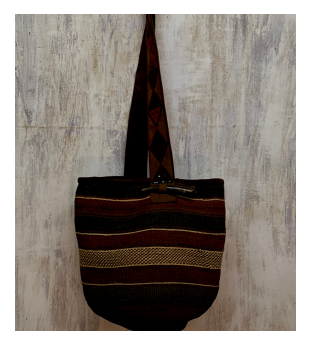
A104 Baobab fiber Basket with beaded handle and cow horn detail 4 • $638 Hand woven, natural root and plant dyes, tone on tone leather handle and beading. Height 14" width 18" circumference 36" Strap 42"