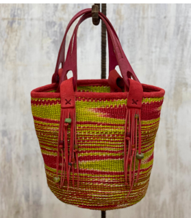
A99 Hand woven, sisal basket 8 • $375

and a leather handle. Yellow and purple hues, trade beads. Height 10" width 14" circumference 28"handle 17".