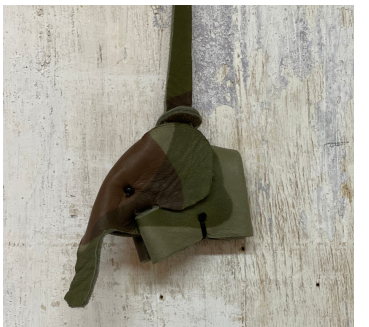
A132 Elephant Keyring 8 • $15 Dark green camouflage. Elephant (2x2") ring strap (3").