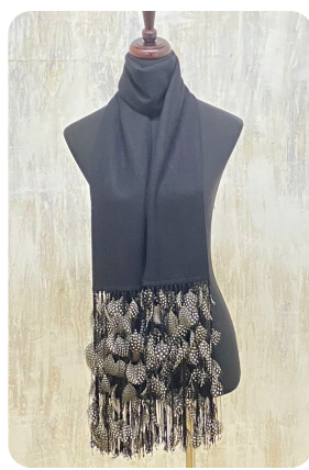
A87 Black Necktie with Guinea Fowl Feather Trim• $743 12"x64" feathers 12".