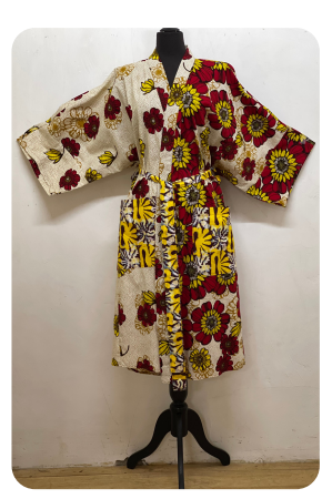
A155 West African Waxed Cotton Robe 1 • $188 100% Cotton, one size.