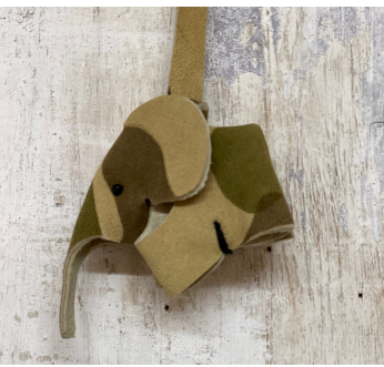
A133 Elephant Keyring 9 • $15 Light beige camouflage. Elephant (2x2") ring strap (3").

For a personalized holiday gifting hamper for unique meaningful gifts to loved ones please contact Anna directly by WhatsApp or email. Many more colours for sunglasses cases and keyrings available.