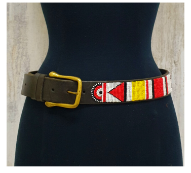
A38 Maasai beaded belt with brass buckle 2 • $102

Traditional design. Fits from 33" to 43".