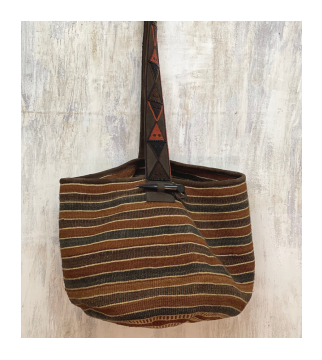
A101 Baobab fiber Basket with beaded handle and cow horn detail 1 • $638 Hand woven, natural root and plant dyes, tone on tone leather handle and beading. Height 14" width 21" circumference 42" Strap 42".