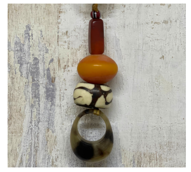
A112 Bag Charm 7 • $95 Cow horn emblem and trade beads, leather 10".