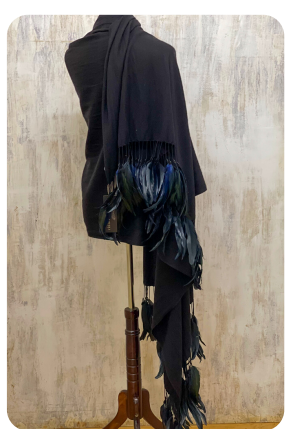
A64 Midnight Blue Cashmere Wrap with Blue Shimmer Rooster Feather Trim • $1,650 36" x 80" feathers 7".

Brown cashmere wrap with criss cross beading design and black ostrich feather trim. 64"x36".