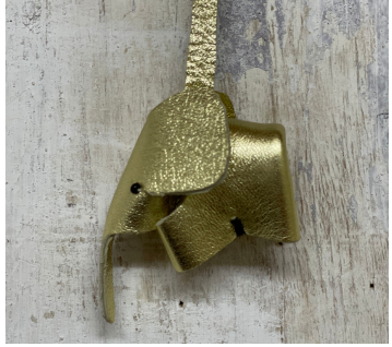
A128 Elephant Keyring 4 • $15 Gold and black. Elephant (2x2") ring strap (3").