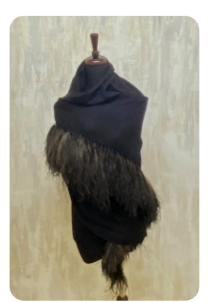
A72 Black Cashmere Wrap with Ostrich feather trim • $1,650