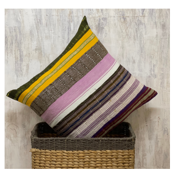
A168 Reconstructed West African Asoke cloth cushion cover 3 • $360 Striped Cushion 30" x 30".