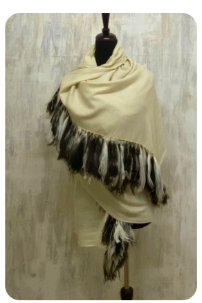
A69 Ivory Cashmere Wrap with Black and White ostrich feather trim • $1,650 38" x80" feathers 6".