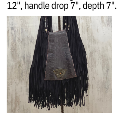
A55 Nicky Fringe Bag Navy Blue Couture • $3,713 Hand cut fringe, trade bead detailing, original native American silver piece . Height 11", width 15", handle 15 ", fringe 7" .