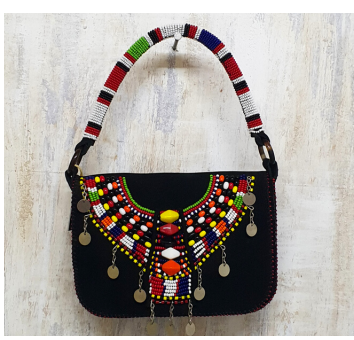
A19 Maa Baguette • $637 Black with traditional beading. Handle drop 6", height 6", width 8", depth 2".