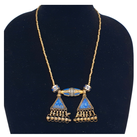
A2 Fine Persian Lapis beads with twin Afghan pendants • $525 18" (2.5"pendant).