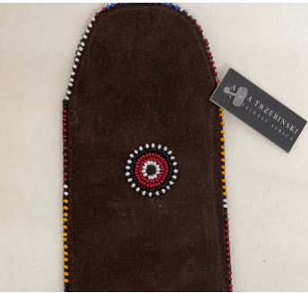
A123 Handmade glasses cases with beading detail 9 • $64