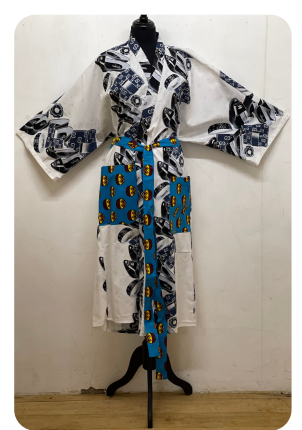
A157 West African Waxed Cotton Robe 3 • $188 100% Cotton, one size.