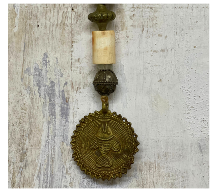
A111 Bag Charm 6 • $132 Antique brass emblem and trade beads leather 10".