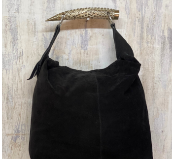
A52 Square Feed Bag with silver studded horn handle • $1,087 Black suede with studded cow horn handle. Height 13", width