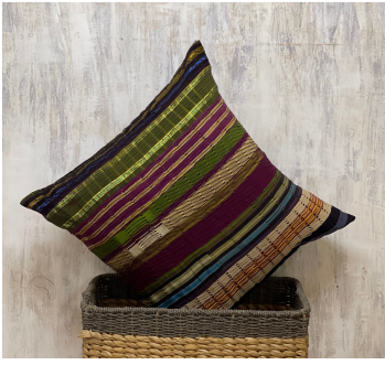
A173 Reconstructed West African Asoke cloth cushion cover 9 • $360 Striped Cushion 30" x 30".

Please note: these cushions are often partially damaged as this is precious cloth that is hand loomed in narrow strips, Anna's team deconstructs them and turns them into these one of a kind cushion covers. NB cover only, no filler.