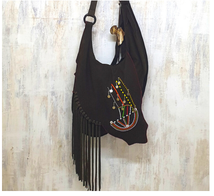
A47 Kenya Bag • $938 Dark Brown. Handle drop 24", height 16", width 16", tassels 12"

Leather bag with braiding detail Beading detail, cow horn rings. Handle drop 22", height 12", width 10", depth 9".