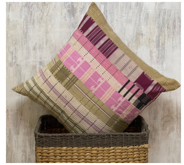
A170 Reconstructed West African Asoke cloth cushion cover 5 • $360 Striped Cushion 30" x 30".