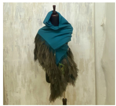
A85 Teal stole with ostrich and peacock feather trim • $1,493 28"x80" feathers 13"