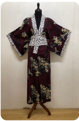
A149 West African Waxed Cotton Kimono 2 • $188 100% Cotton, one size.