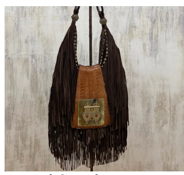
A57 Nicky Fringe Bag brown couture • $2,784 Hand cut fringe, trade beads, original Afghani silver with carnelian. Height 11", width 15", handle 15 ", fringe 7".