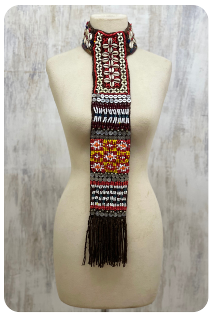
A16 Afghan tribal necklace $2,663 Neck 17", 22" length.