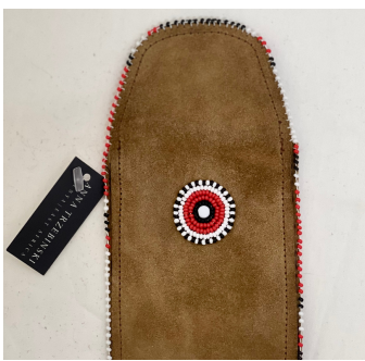
A115 Handmade glasses cases with beading detail 1 • $64 Beaded, suede, 3.5" x 6.5".