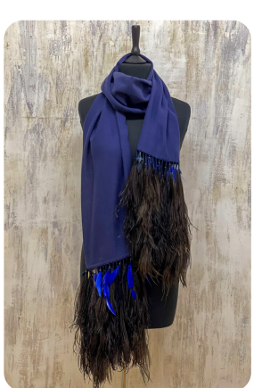
A91 Navy blue Necktie with black Ostrich feather and shiny blue Rooster feather trim • $743 12"x64" feathers 12".

Please note, some items are available to special order and there is a large selection of neckties available in studio not displayed in this catalogue. Please contact Anna directly by WhatsApp or email with any questions.