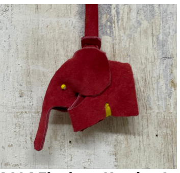
A126 Elephant Keyring 2 • $15 Red and yellow. Elephant (2x2") ring strap (3").