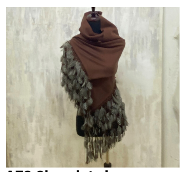
A79 Chocolate brown Cashmere Wrap with Guinea Fowl feather trim • $1,493 Winter Weight. 28"x18" feathers 12"