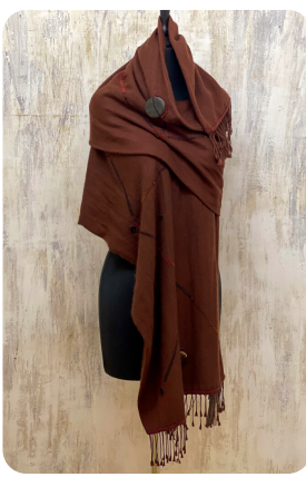
A62 Zig zag beaded Shawl • $1.493 Cashmere wrap with tone on tone beading design. 36"x80".

Brown Cashmere wrap with tone on tone beaded band and black ostrich feather trim. 36"x80" beading 2.5" and feathers 6".