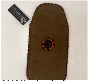
A119 Handmade glasses cases with beading detail 5 • $64 Beaded, suede, 3.5" x 6.5".