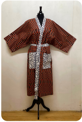
A158 West African Waxed Cotton Robe 4 • $188 100% Cotton, one size.