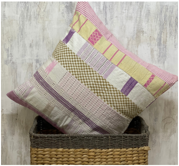
A169 Reconstructed West African Asoke cloth cushion cover 4 • $360 Striped Cushion 30" x 30".