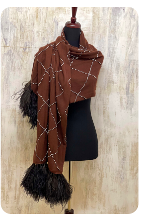
A63 Watootsie Luxury Cashmere Wrap • $2,212

Brown cashmere wrap with criss cross beading design and black ostrich feather trim. 64"x36".