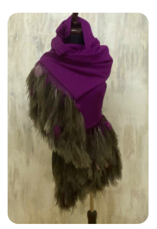
A70 Magenta Cashmere Wrap with Grey Ostrich Feathers • $1,493