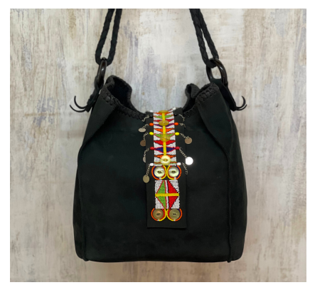
A46 Maasai Isabella Bag • $1,012

Leather bag with braiding detail Beading detail, cow horn rings. Handle drop 22", height 12", width 10", depth 9".