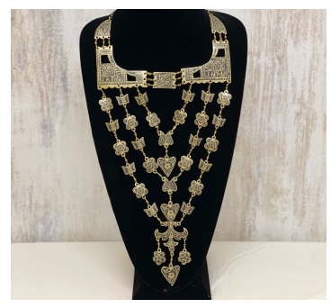
A14 Tribal Collar Piece (original). • $728 14" 11" drop .