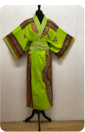
A150 West African Waxed Cotton Kimono 3 • $188 100% Cotton, one size.