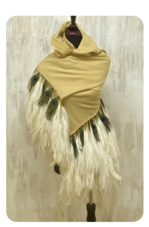
A77 Ivory Cashmere Wrap with white Ostrich and peacock feather trim • $1,493 28"x80" feathers 12".