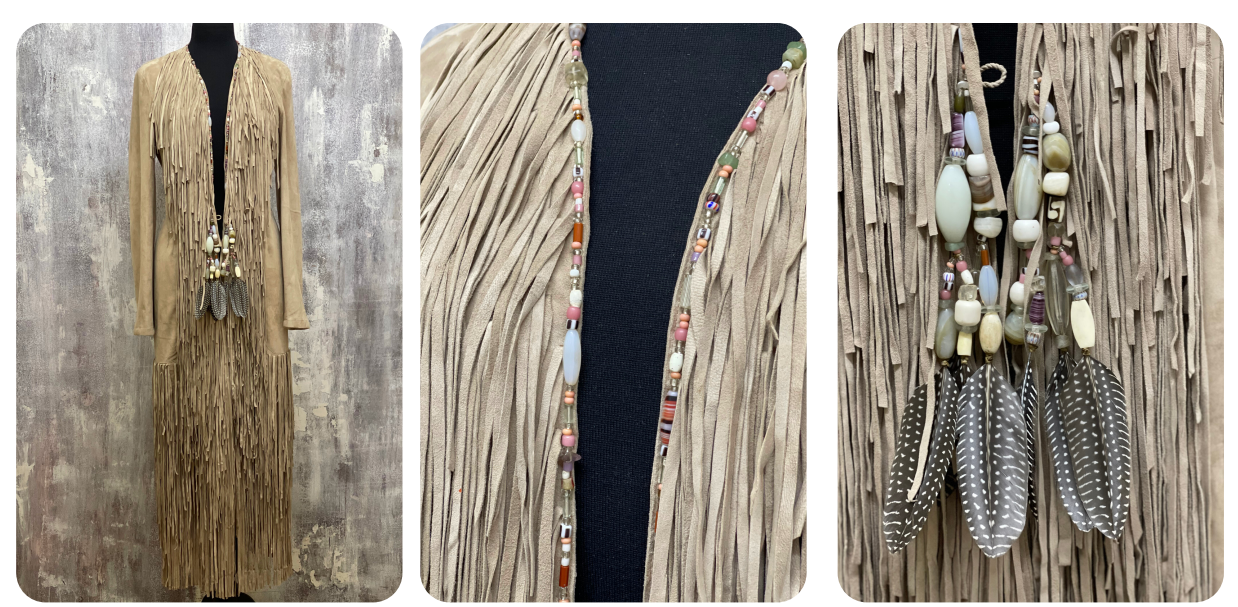
A177 Navajo fringe coat • $3,600 Requires direct communication with Anna. Made to measure or existing pieces available.