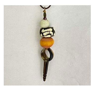
A114 Bag Charm 9 • $95 Cow horn emblem and trade beads, leather 10".