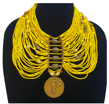
A10 Trade bead, Persian bead and West African emblem. • $1,089 16" (3" pendant).