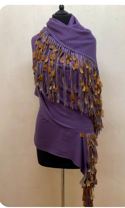
A74 Lavender Cashmere Wrap with copper feather trim • $1,493 28"x80" feathers 12".