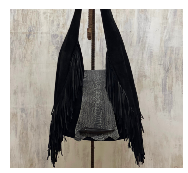
A54 MJ Bali Bag Black • $1,313

Classic hobo bag design with hand cut fringe. Suede Ostrich shin flap with horn detail. Height 13", width 13", depth 8", handle 24 ", fringe 6".