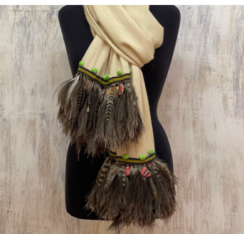
A81 Ivory Cashmere Luxe • $2,213 Beaded detailing with rare green turquoise beads ostrich and rooster feather trim interlaced with pink west African trade beads. 36"x80" feather 6"