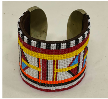
A40 Maasai Beaded Cuff with silver tips 2 • $400 Adjustable (crimp on) suede with beading . 8" long, 3" wide.

Traditional design. Fits from 28" to 33".