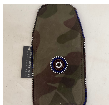
A118 Handmade glasses cases with beading detail 4 • $64 Beaded, leather, 3.5" x 6.5".