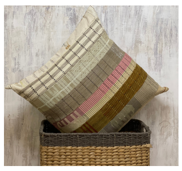
A166 Reconstructed West African Asoke cloth cushion cover 1 • $360 Striped Cushion 30" x 30".