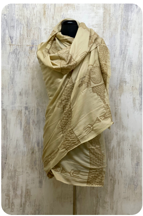
A68 Sheer Cashmere wrap with West African Embroidery • $2,760 38" × 78".