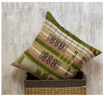
A171 Reconstructed West African Asoke cloth cushion cover 6 • $360 Striped Cushion 30" x 30".