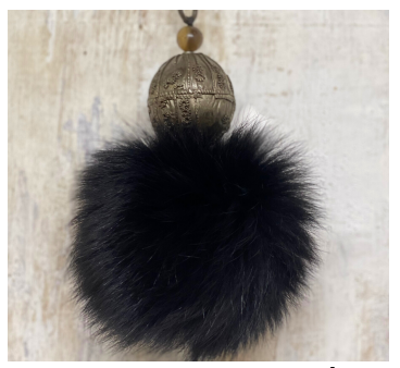
A106 Bag Charm 1 • $169 Fox fur pom pom and trade beads, leather, 12".