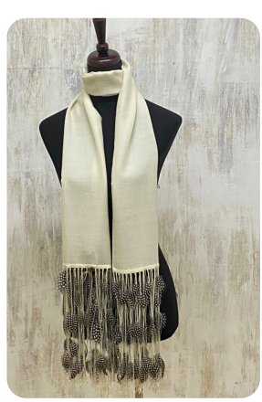
A90 Ivory Necktie with Guinea Fowl Feather Trim • $713 12"x64" feathers 12".