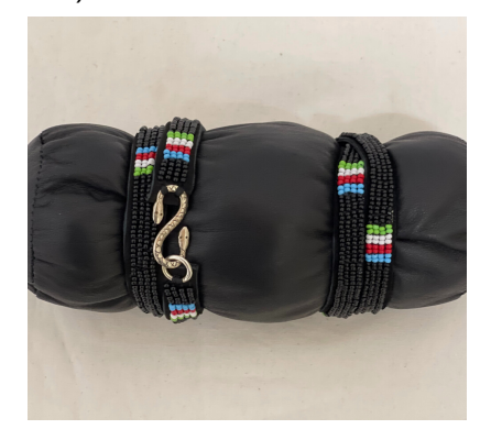
A23 Maasai wrap bracelets with silver clasp Large • $112 each Leather with traditional beading . 16"

A20 Maasai Honey Bag • $938 Black with traditional beading. Handle drop 11", height 13", width 16", tassels 7".