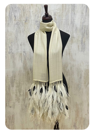
A89 Ivory Necktie with white Ostrich and Black rooster Feather Trim • $713 12"x64" feathers 12".