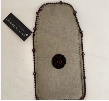
A120 Handmade glasses cases with beading detail 6 • $64 Beaded, leather, 3.5" x 6.5".