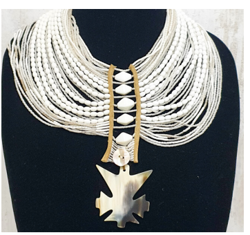
A26 Maa Choker with cow Horn Emblem XL • $338 White. 17".