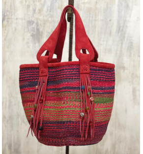
A95 Hand woven, sisal basket 4 • $337 Embellished with trade beads and a leather handle. Red hues, trade beads.Height 10" width 15" circumference 30"handle 17".

A92 Hand woven, sisal basket 1 • $375 Embellished with trade beads and a ostrich shin handle. Blue/denim and red hues. Height 10" width 14" circumference 28" handle 17".