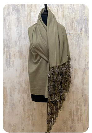
A76 Silver Cashmere Wrap with Guinea fowl feather trim • $1,493 28"x80" feathers 12".