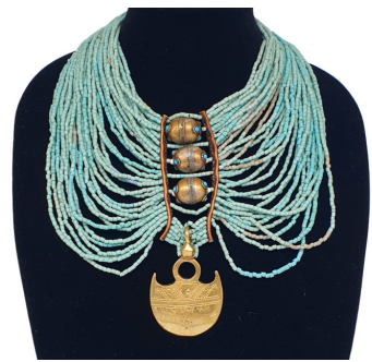
A12 Trade bead, Persian bead and Tuareg emblem. • $1,089 16 " (3" pendant).