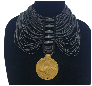
A11 Trade bead and West African emblem. • $1,089 16" (3" pendant).