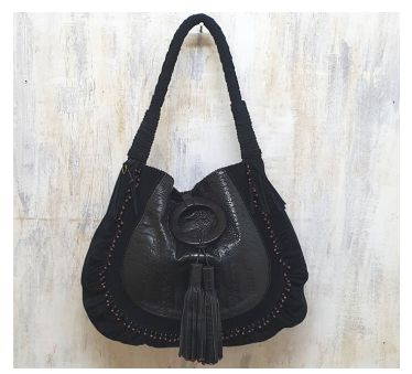
A53 Ostrich Heirloom Bag black • $1,762 Braided detailing, horn and beading. Height 12" width 17", depth 2.5", handle 22".

Trade bead and agate handle. Silver ball bead and feather detail .Height 7", width 6", depth 2",handle drop 5".