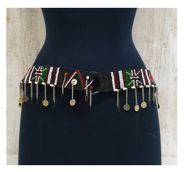
A35 Beaded belt 1 multi size Velcro closure • $150

Traditional design. Fits from 33" to 43".