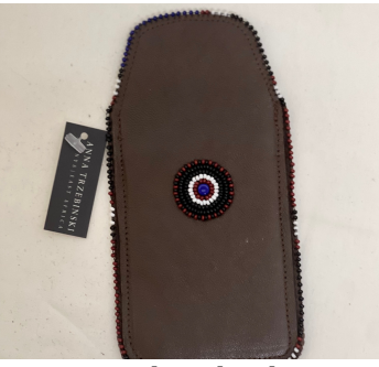
A116 Handmade glasses cases with beading detail 2-$64 Beaded, leather, 3.5" x 6.5".