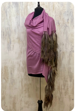
A73 Ashes of Rose Cashmere Wrap with Ostrich and Peacock feather trim • $1,463 28"x80" feathers 12".