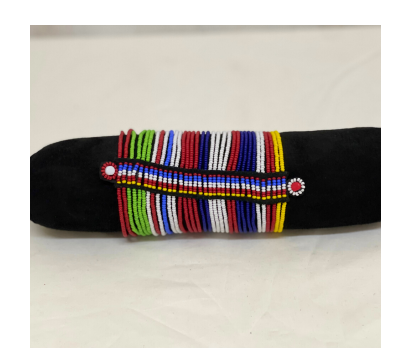
A33 Maasai gladiator bracelet with snap button closure M • $109 Medium. Length 8", width 4"

Traditional Necklace original. 15" drops down approx.12".