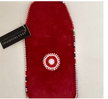
A122 Handmade glasses cases with beading detail 8 • $64 Beaded, suede. 3.5" x 6.5".