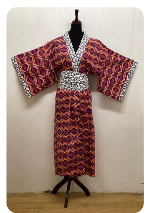
A148 West African Waxed Cotton Kimono 1 • $188 100% Cotton, one size.