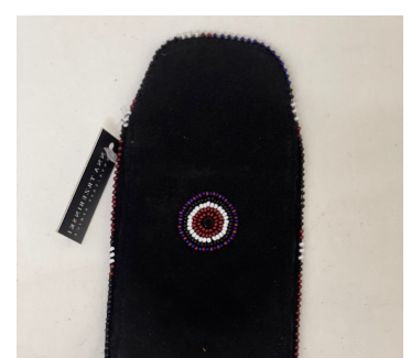
A117 Handmade glasses cases with beading detail 3 • $64 Beaded, suede, 3.5" x 6.5".