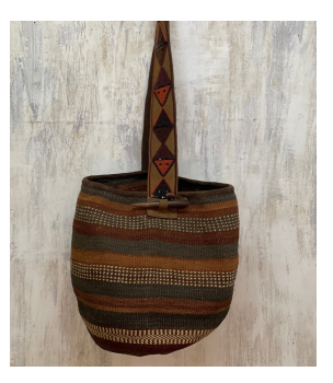
A103 Baobab fiber Basket with beaded handle and cow horn detail 3 • $638 Hand woven, natural root and plant dyes, tone on tone leather handle and beading. Height 14" width 17" circumference 34" Strap 42".