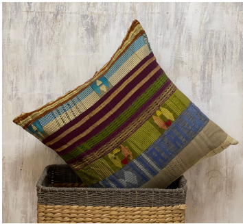
A172 Reconstructed West African Asoke cloth cushion cover 7 • $360 Striped Cushion 30" x 30".