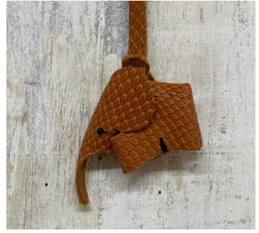
A129 Elephant Keyring 5 • $15 Tan faux stamped Boa and black. Elephant (2x2") ring strap (3").