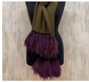
A83 Military Green cashmere Luxe • $1,872 Military green with grape ostrich feathers and semi precious stones. 36"x80" feathers 6"