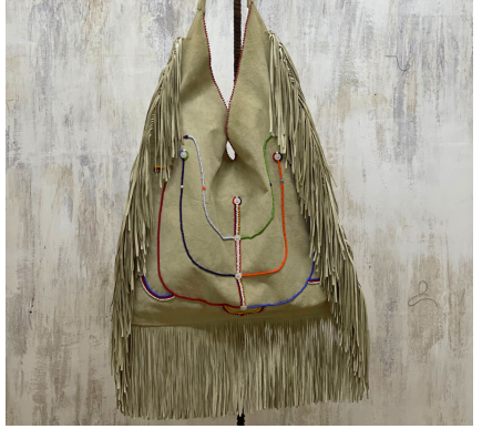
A21 Maasai Honey Bag • $938

Orange with traditional beading. Handle drop 4", height 6", width 11.5", depth 6".