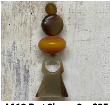
A113 Bag Charm 8 • $95 Cow horn emblem and trade beads, leather 10".