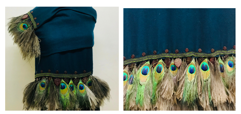
A84 Emerald Cashmere Luxe • $2,213 Emerald green cashmere with beaded band and ostrich and peacock feathers. 36"x80" feathers 6"