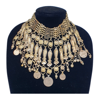
A13 Afghan Tribal Necklace (original piece). • $728 13".