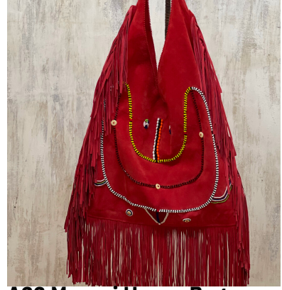
A22 Maasai Honey Bag • $938

Red with traditional beading. Handle drop 11", height 13", length 16", tassels 7".