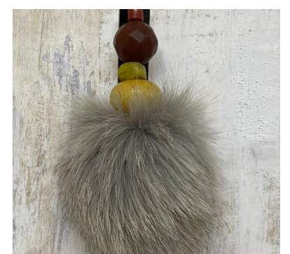
A109 Bag Charm 4 • $169 Fox fur pom pom and trade beads, leather, 12".