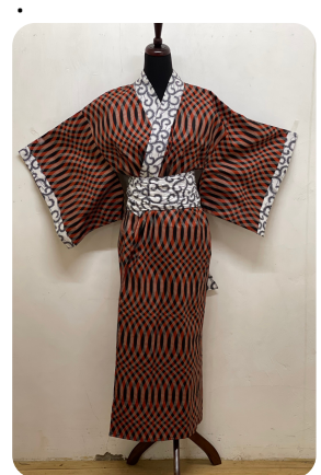
A151 West African Waxed Cotton Kimono 4 • $188 100% Cotton, one size.