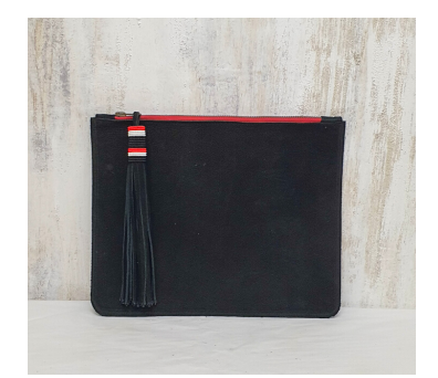
A42 Maa pouch (flat) M • $195 Black with toggle zipper pull. Height 10", Width 10".