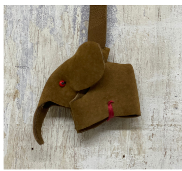
A125 Elephant Keyring 1 • $15 Brown and red. Elephant (2x2") ring strap (3").