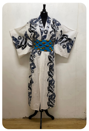
A152 West African Waxed Cotton Kimono 5 • $188 100% Cotton, one size.