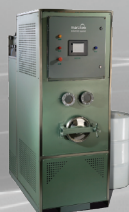
Solvent Saver Printing - SSP