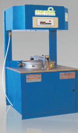
Solvent Saver Batch - SSB