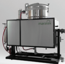
Solvent Saver Batch Premium - SSBP