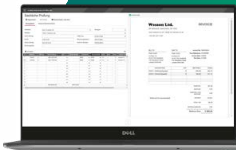
Simple release of cost or purchase order calculations.

The artificial intelligence (AI) in d.velop smart invoice for Microsoft 365 monitors and imports the channels automatically. Separating and scanning individual invoices with barcodes, a process with which you may be familiar, can be fully dispensed with. The AI also provides support in this regard. The same applies to the subsequent classification and synchronization with any master data or order data from the ERP system.