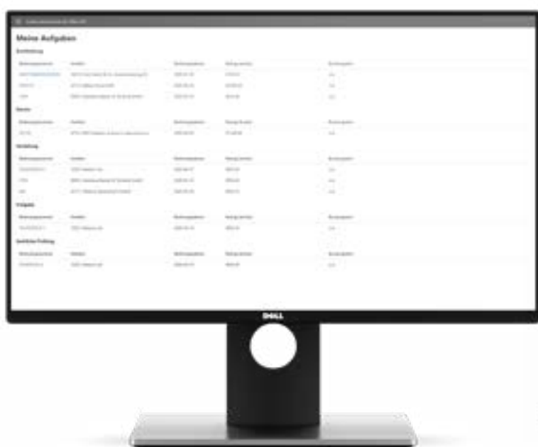
All your tasks in view.