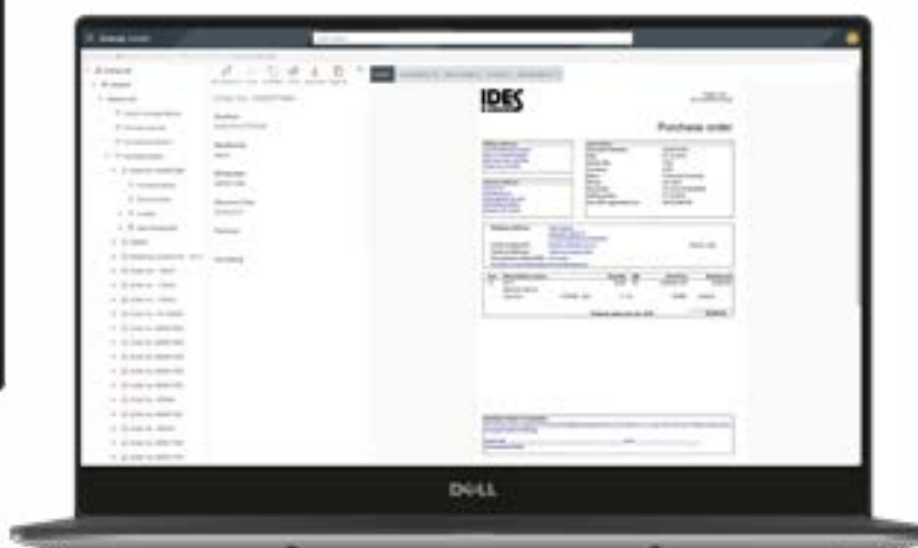
Orders, e-mail correspondence, goods receipts and invoices can be brought together and presented clearly in order dossiers.