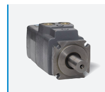
Piston Motors Repair