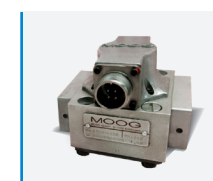
Servo Valve Repair