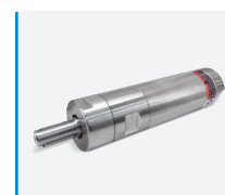
Vane Motors Repair