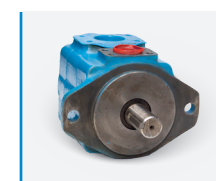
Vane Pumps Repair