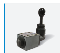
Manual Valve Repair