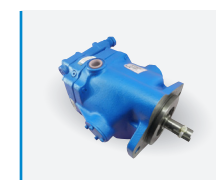
Piston Pumps Repair