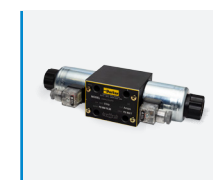
Solenoid Valve Repair