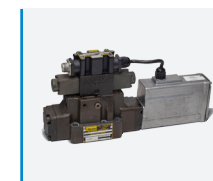
OBE Proportional Valve Repair