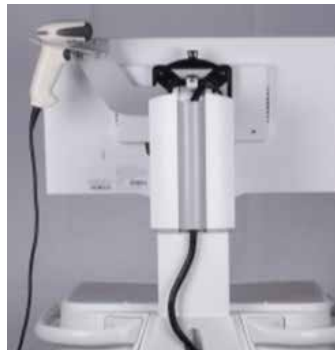
Tethered Scanner Mount