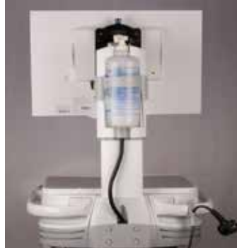
Hand Sanitizer (Large)