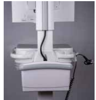
Basket with Rear Handle