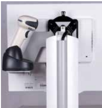
Wireless Scanner Mount

Howard Medical offers many accessories to facilitate efficiency for healthcare professionals. Multiple mounting options are available for the right mix and best location. Many other choices available to customize your cart to meet your workflow needs. See your IMS Sales Representative for details or a demonstration.