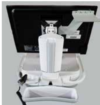
Zebra Label Printer Bracket