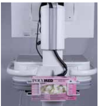
Glove Box Holder