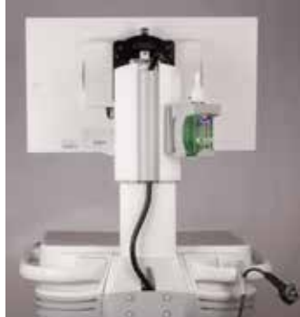
Hand Sanitizer (Small)