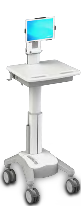
HI-CORE TABLET CART