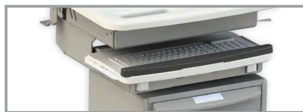
STANDARD KEYBOARD TRAY