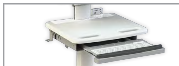
SLIMLINE KEYBOARD TRAY