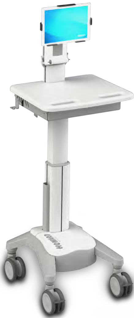
HI-CORE TABLET CART

As more applications support tablet usage, the HI-Core Tablet cart configuration provides an ideal platform for mobility, with support for a variety of tablets.