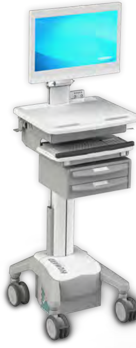
HI-CORE LCD CART