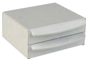
(2) SINGLE-TIER DRAWERS