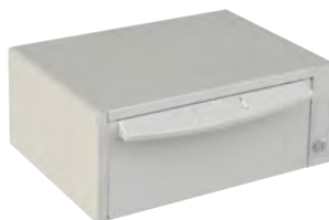
(1) TWO-TIER DRAWERS