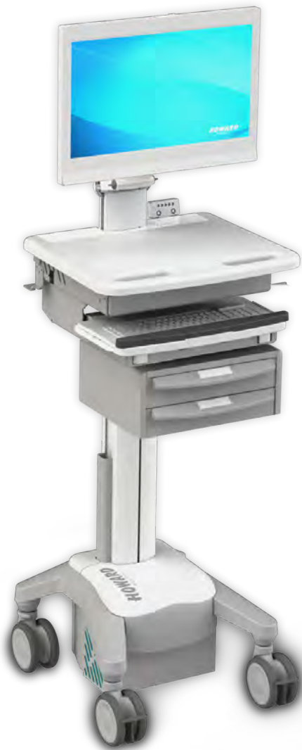
HI-CORE LCD CART

The HI-Core LCD Cart configuration is a traditional point-of-care cart setup for LCD screens with small form factor or zero-client personal computer.