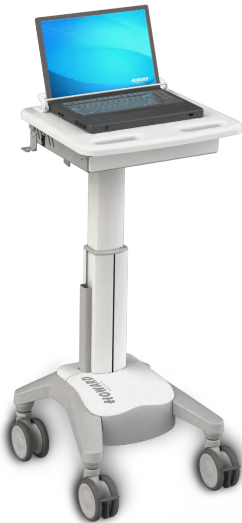
HI-CORE NOTEBOOK CART

The HI-Core Notebook Cart configuration comes powered or non-powered. The notebook can be secured on top or placed underneath the work surface.