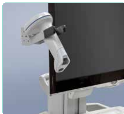
Forked Scanner Holder