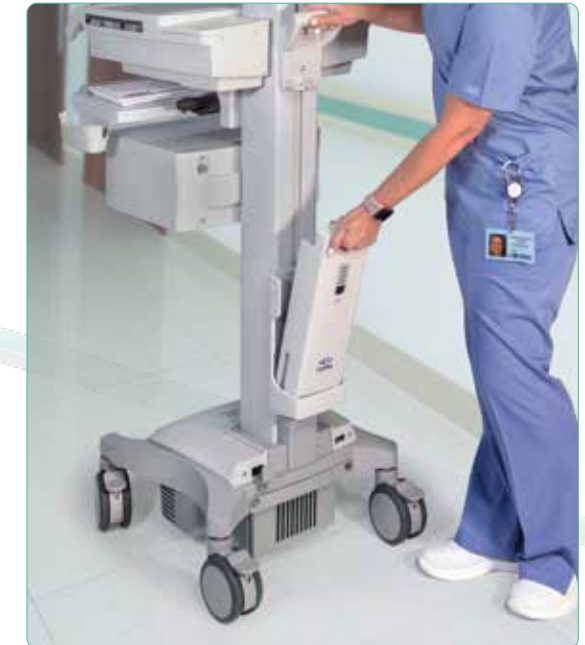
GoLiFe™ Swappable Battery

See pages 10 and 11 to learn more about N-Sight