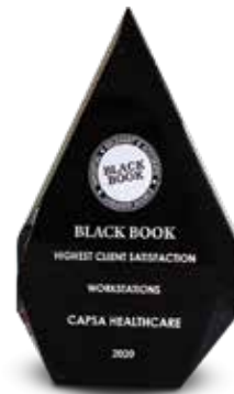
Black Book Award Recognized in 2020 for the highest user satisfaction in a 3rd party research study