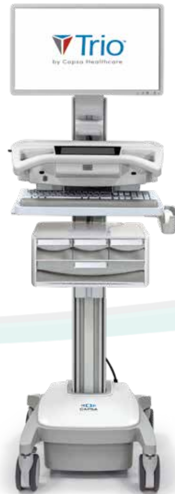
Trio with Standard Bins