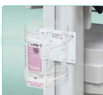
Sanitizing Wipes Bracket