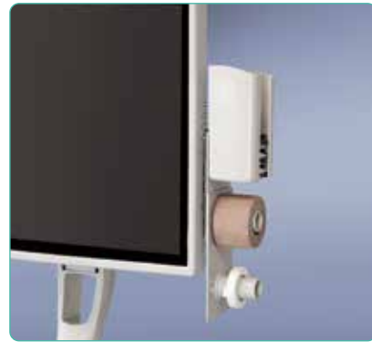
Access Pack Multiple Sizes