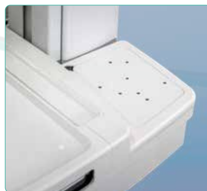
Scanner Base Plate