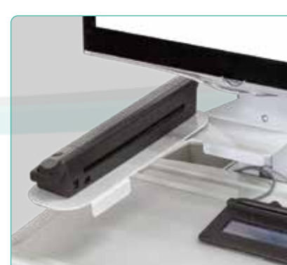
Document Scanner Shelf