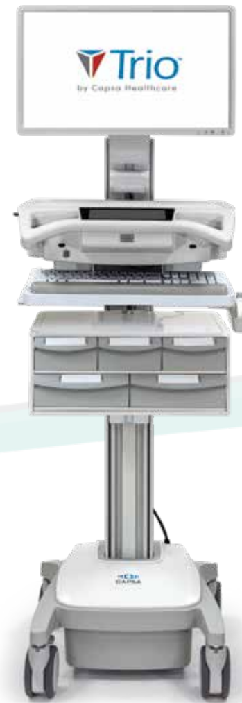
Trio with MaxBin System