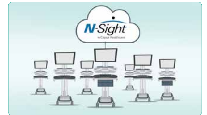
Optimize Your Fleet