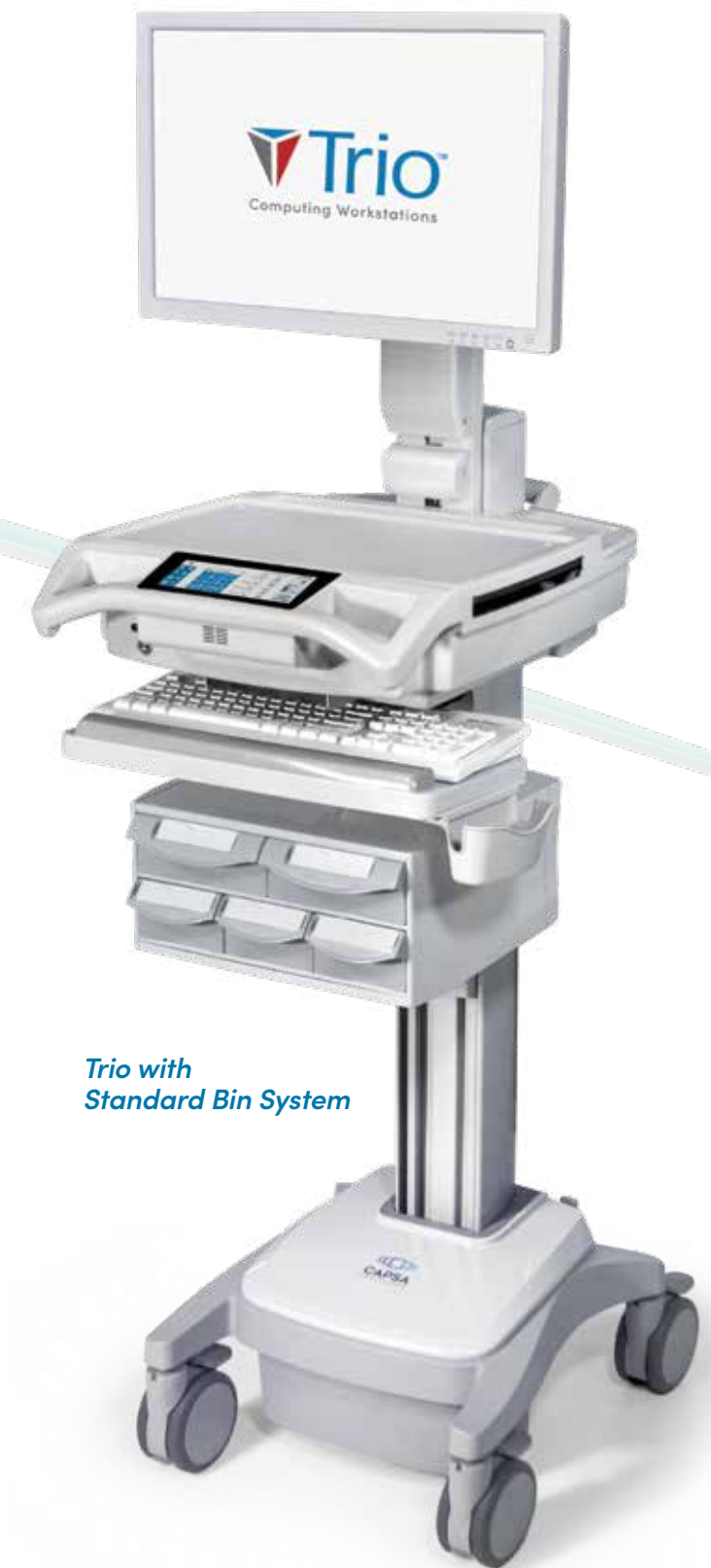
Trio with Standard Bin System

See Trio's storage options on Page 14 & 15