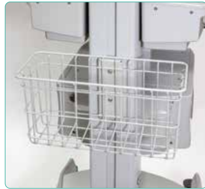
Wire Basket Two Sizes

Choose from a selection of accessories to configure Trio for an array of care applications, medication management, and procedure support.