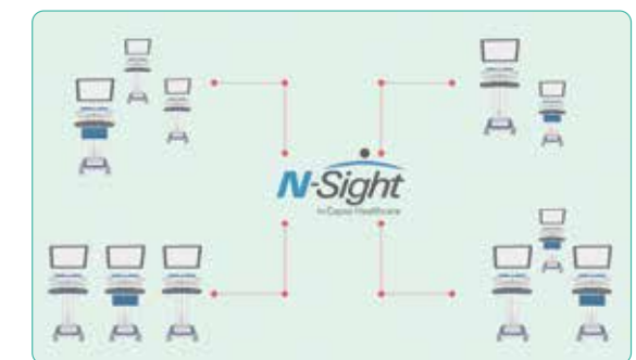
Optimize Your Fleet