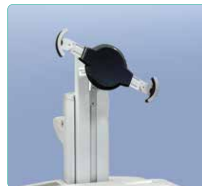
Tablet Mount Multiple Options