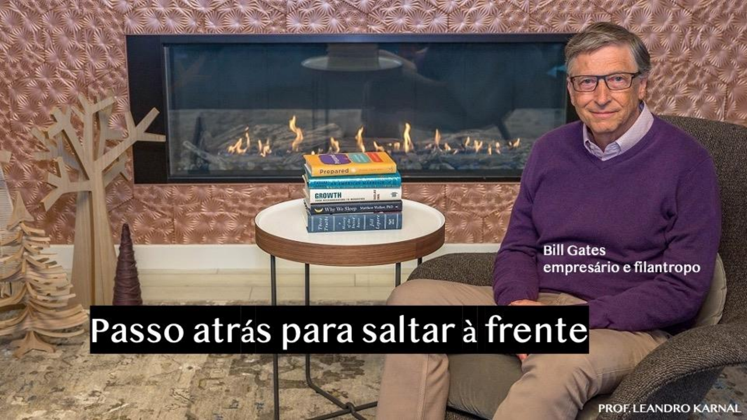
Bill Gates empresário e filantropo