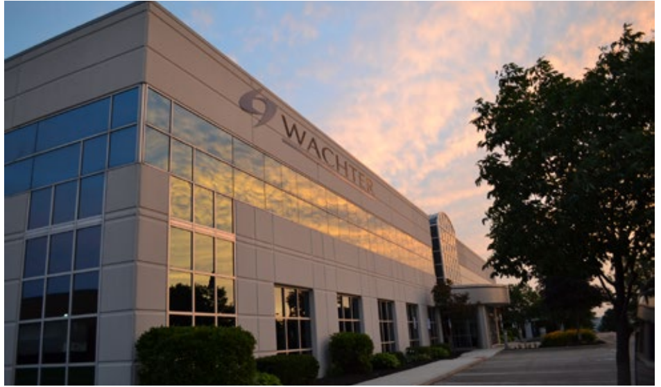
Wachter's company headquarters, located in Lenexa, KS