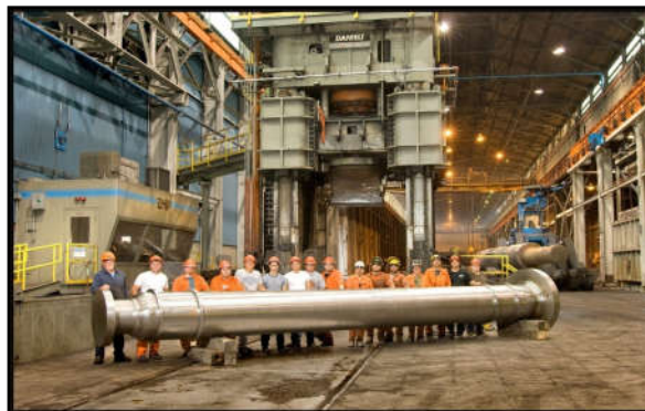
Mine Hoist Shaft