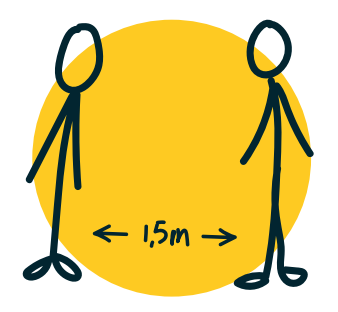
KEEP YOUR DISTANCE FROM OTHERS

With this handout we hope to give you the necessary information to safely use Microlab. We're doing our best to ensure that everyone can make use of Microlab in a safe and pleasant way, but we can't do this alone! Stay at home if you have any health complaints. If you do come to Microlab, we ask you to comply with the measures mentioned below.