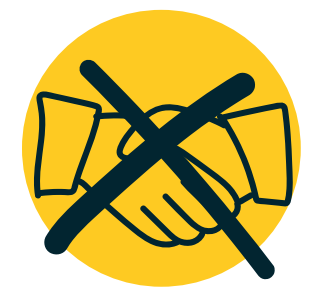
AVOID CONTACT WITH OTHERS