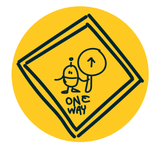
FOLLOW INSTRUCTIONS BY MICROLAB