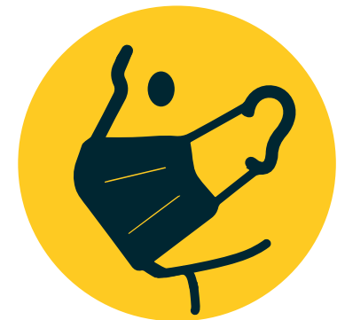
WEAR A FACEMASK IN COMMON AREAS