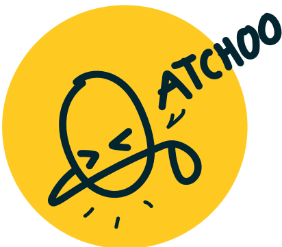
SNEEZE IN YOUR ELBOW "BLESS YOU"