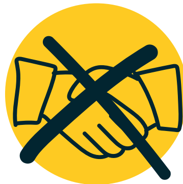
AVOID DIRECT CONTACT WITH OTHERS