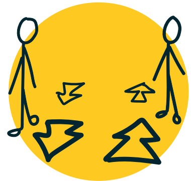
KEEP TO THE RIGHT RIGHT IS ALWAYS RIGHT