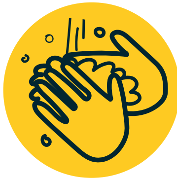
WASH YOUR HANDS REGULARLY