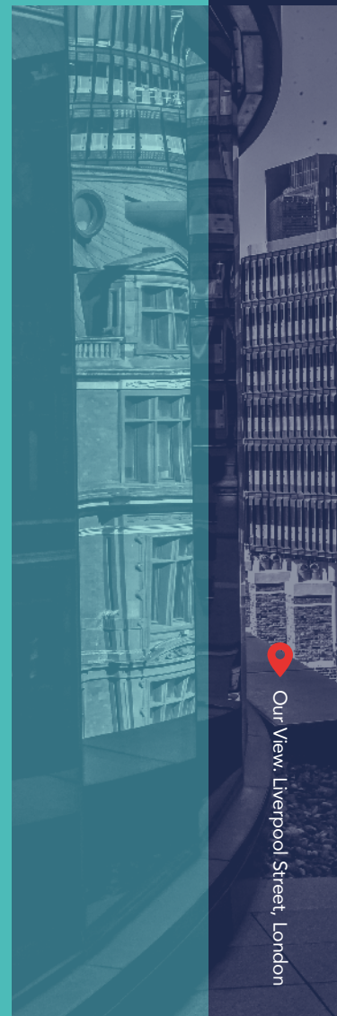
Our View: Liverpool Street, London