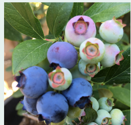
BOUNTIFUL™ DELIGHT FRUIT