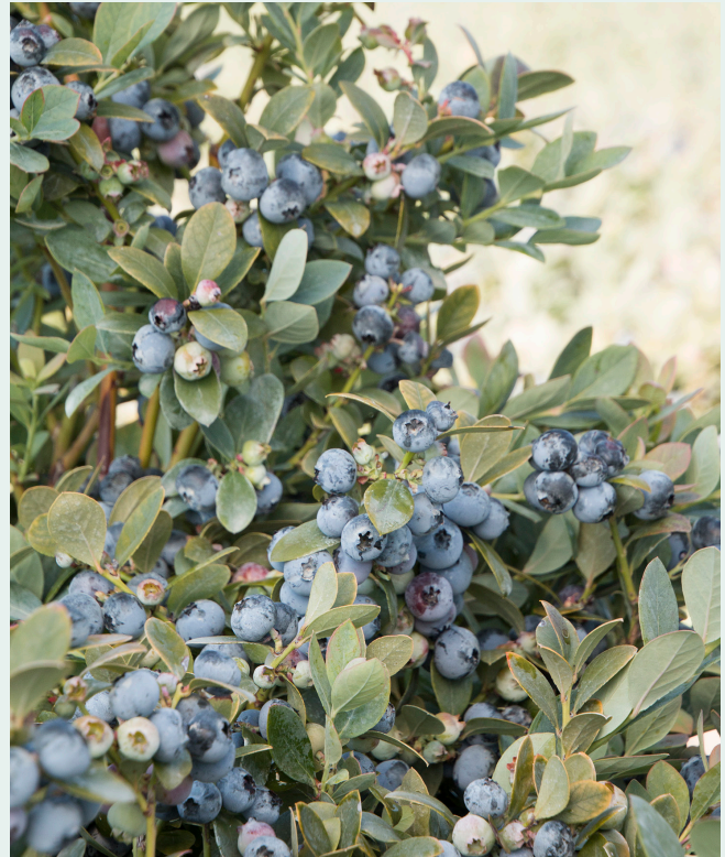
BOUNTIFUL BLUE® FRUIT

Deciduous to Semi-Evergreen. Monrovia Exclusives.