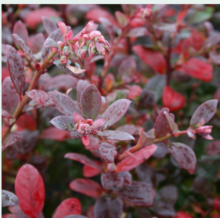
BOUNTIFUL BLUE® FALL FOLIAGE