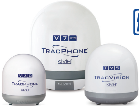
Matching solutions for every size boat or yacht.

That's why KVH is the number one choice to keep you connected at sea with Internet, voice, and live TV. Our award-winning TracPhone® and TracVision® connectivity solutions deliver cutting-edge technology to give you an at-home experience wherever you go. Whether relaxing with family and friends, working remotely, or both, KVH has your perfect solution.